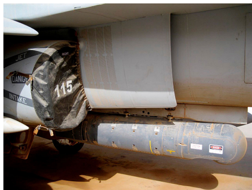
F-18 Intake Covers

The McDonnell Douglas F-18 Hornet, Super Hornet Intake Covers are designed to install easily yet be completely storable. A spring steel hoop is sewn into the hem of each cover, allowing them to be installed without climbing onto the wing or using a stepladder. To store the covers the spring steel hoop folds like a band-saw blade into three nesting rings. Each cover folds into a compact circular bundle which is stored in the included duffle bag, yet they unfold quickly for use. The Tri-Fold Ring cover is made of medium weight nylon which is available in a variety of colors to match the paint trim. Each cover set comes complete with installation and folding instructions. The aircraft's registration number can be silkscreened onto the cover for an extra charge.