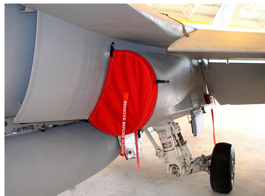
F-18 Engine Inlet Cover