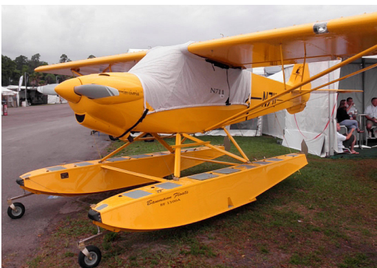
Cub Crafters Carbon Cub Canopy Cover

This cover type is made from Silver Acrylic Sunbrella canvas and is 100% lined with a soft and smooth microfiber. Bruce's Custom Covers developed this material combination especially for aircraft protection. The outer material is medium weight and treated for water resistance, UV resistance and anti-static buildup. The inner lining is a very soft and smooth microfiber to prevent scratching. The material is very reflective, and tests show that the cabin interior temperature can be reduced to near-ambient temperature on the hottest of days. It is water, ice and snow repellent, yet breathable to allow moisture to escape from between the cover and the aircraft surface.