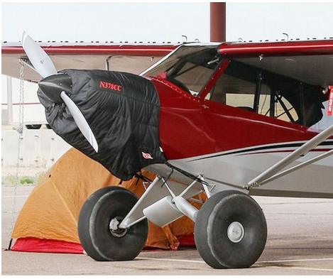
Cub Crafters Carbon Cub Insulated Engine Cover