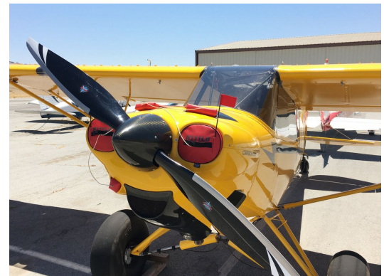
Cub Crafters CC-11 Carbon Cub Engine Plugs