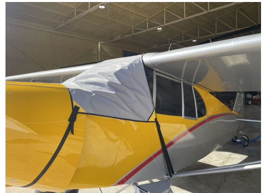
Piper PA-18 Windshield/Skylight Cover