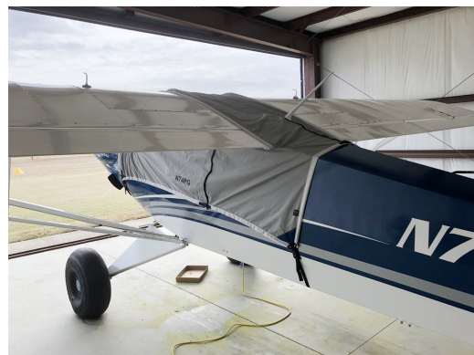
Cub Crafters Carbon Cub Travel Weight Canopy Cover