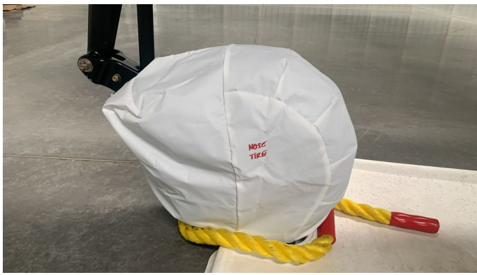
Cub Crafters Tire Covers, tricycle gear, test fit covers