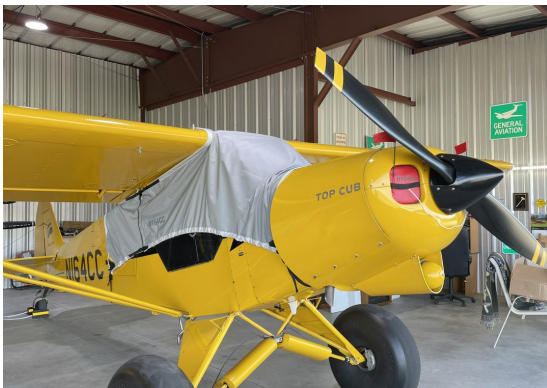
Cub Crafters CC-18 Light Weight Travel Canopy Cover, Engine Plugs

Engine Inlet Plugs are custom fit for your CubCrafters CC-18, 19, 20, Top Cub, CCK-1865, CC-19 X-Cub, CCX-2000, EX-3, FX-3 intakes, made with heavy-duty vinyl material, and stuffed with a single block of sculpted urethane foam. Each plug has a zipper that allows the foam to be removed and dried if necessary. Engine plugs have warning flags that are visible from the cockpit or 'remove before flight' streamers sewn onto the face of the plugs. Most plugs are imprinted with the aircraft registration number in black for an extra charge. Storage bag NOT included. Engine plugs may be inserted after flight when the engine is still warm. Engine Inlet Plugs are commonly referred to as Cowl Plugs, Intake Plugs, Cowl Blocks, Engine Blocks, and Engine Bung.