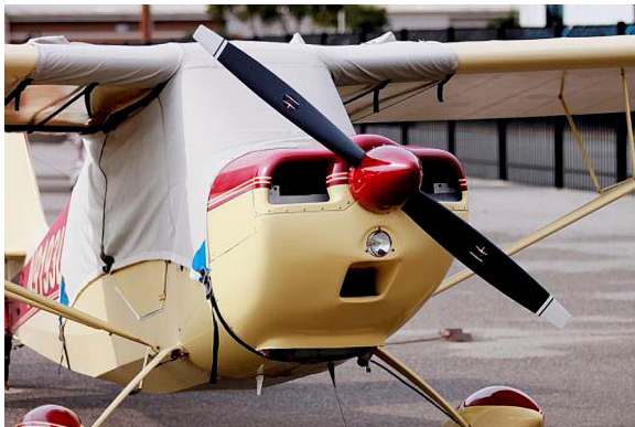
Bellanca Citabria Over-the-Top Canopy Cover, extended to cover gas caps

This cover type is made from Silver Acrylic Sunbrella canvas and is 100% lined with a soft and smooth microfiber. Bruce's Custom Covers developed this material combination especially for aircraft protection. The outer material is medium weight and treated for water resistance, UV resistance and anti-static buildup. The inner lining is a very soft and smooth microfiber to prevent scratching. The material is very reflective, and tests show that the cabin interior temperature can be reduced to near-ambient temperature on the hottest of days. It is water, ice and snow repellent, yet breathable to allow moisture to escape from between the cover and the aircraft surface.