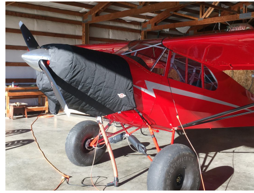
Piper PA-12 Insulated Engine Cover