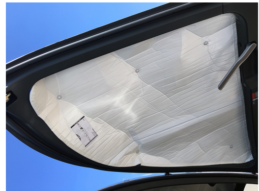
Eurocopter EC-145 Cockpit Heatshields