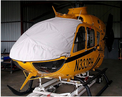
EC-135 Windshield/Skylights Cover, pinches in door jambs

This cover type is made from Silver Acrylic Sunbrella canvas and is 100% lined with a soft and smooth microfiber. Bruce's Custom Covers developed this material combination especially for aircraft protection. The outer material is medium weight and treated for water resistance, UV resistance and anti-static buildup. The inner lining is a very soft and smooth microfiber to prevent scratching. The material is very reflective, and tests show that the cabin interior temperature can be reduced to near-ambient temperature on the hottest of days. It is water, ice and snow repellent, yet breathable to allow moisture to escape from between the cover and the aircraft surface.