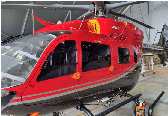
Airbus Helicopter H145D3 Intake Plugs

The Engine Inlet Plugs are custom fit for your Eurocopter EC-145, UH-145, BK-117 D-2 intakes, made with heavy-duty vinyl material, and stuffed with a single block of sculpted urethane foam. Each plug has a zipper that allows the foam to be removed and dried if necessary. Engine plugs have 'Remove Before Flight' streamers sewn onto the face of the plugs. Most plugs are imprinted with the aircraft registration number in black for an extra charge. Storage bag NOT included. Engine plugs may be inserted after flight when the engine is still warm. Engine Inlet Plugs are commonly referred to as Cowl Plugs, Intake Plugs, Cowl Blocks, Engine Blocks, and Engine Bungs.