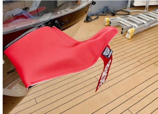
Airbus Helicopter H145 Pitot Tube Cover