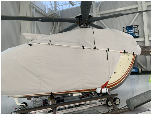
Eurocopter 145 Engine Area Cover, Bubble Cover

The Engine Inlet Plugs are custom fit for your Eurocopter EC-145, UH-145, BK-117 D-2 intakes, made with heavy-duty vinyl material, and stuffed with a single block of sculpted urethane foam. Each plug has a zipper that allows the foam to be removed and dried if necessary. Engine plugs have 'Remove Before Flight' streamers sewn onto the face of the plugs. Most plugs are imprinted with the aircraft registration number in black for an extra charge. Storage bag NOT included. Engine plugs may be inserted after flight when the engine is still warm. Engine Inlet Plugs are commonly referred to as Cowl Plugs, Intake Plugs, Cowl Blocks, Engine Blocks, and Engine Bungs.