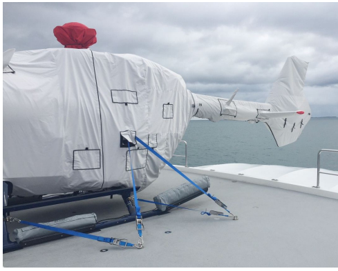
Eurocopter EC-145 D2 Main Body Cover, Tailboom/Fenestron Cover