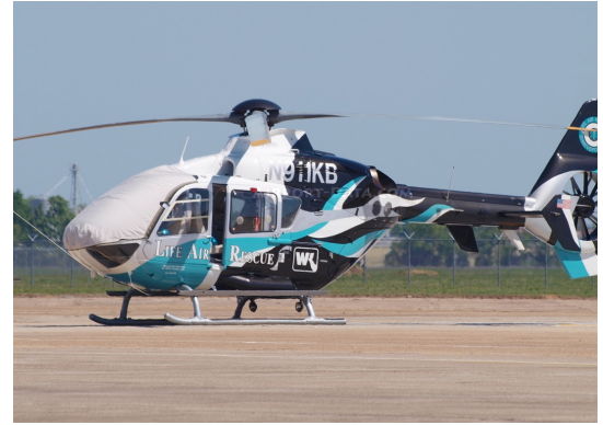
Eurocopter EC-135 Windshield/Skylight Cover