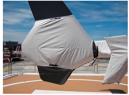
EC-135 Tailfan Cover and Tailboom Stabilizer Cover