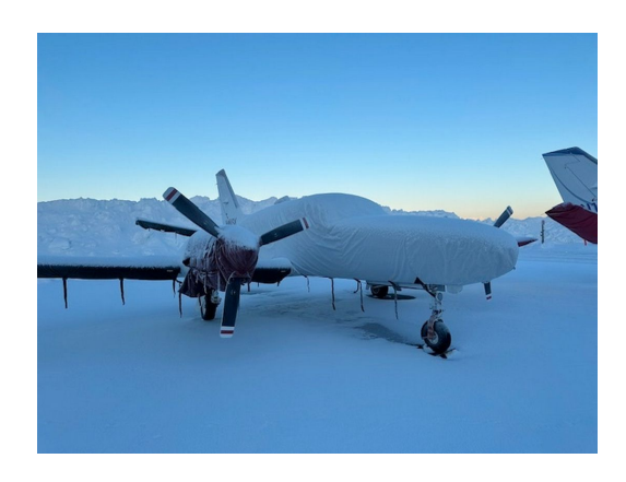
Cessna 441 Extended Canopy/Nose Cover

Covers developed this material combination especially for aircraft protection. The outer material is medium weight and treated for water resistance, UV resistance and anti-static buildup. The inner lining is a very soft and smooth microfiber to prevent scratching. The material is very reflective, and tests show that the cabin interior temperature can be reduced to near-ambient temperature on the hottest of days. It is water, ice and snow repellent, yet breathable to allow moisture to escape from between the cover and the aircraft surface.