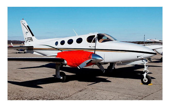
Cessna 340 Insulated Engine Covers

This cover type is made from Silver Acrylic Sunbrella canvas and is 100% lined with a soft and smooth microfiber. Bruce's Custom Covers developed this material combination especially for aircraft protection. The outer material is medium weight and treated for water resistance, UV resistance and anti-static buildup. The inner lining is a very soft and smooth microfiber to prevent scratching. The material is very reflective, and tests show that the cabin interior temperature can be reduced to near-ambient temperature on the hottest of days. It is water, ice and snow repellent, yet breathable to allow moisture to escape from between the cover and the aircraft surface.