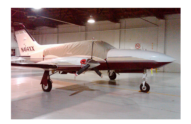
Cessna 414 Canopy Cover and Engine Inlet Plugs

Travel Covers are made with Silver Solution-Dyed Polyester fabric and only lined over the windshield to save weight. The material is lightweight and more compact for easy stowage in the aircraft. The polyester material is water resistant, but only intended for occasional use outside. We also have an ultra lightweight material available for fitted hangar dust covers. For daily outdoor use, the non-travel Sunbrella Cover is the best choice.