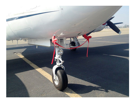
Cessna 421 Pltot Covers set