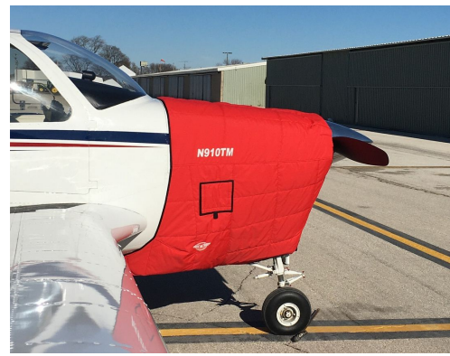
Beech Debonair Insulated Engine Cover