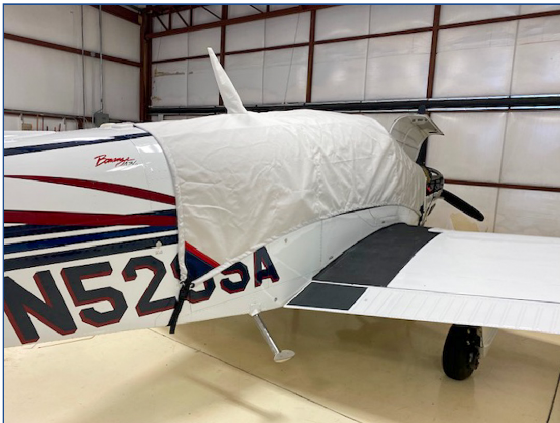
Beech Bonanza 36 Models Canopy Cover