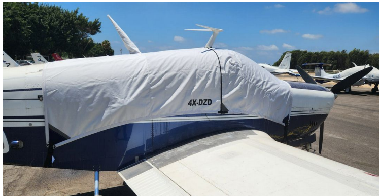
Beech A36 Bonanza Canopy Cover

This cover type is made from Silver Acrylic Sunbrella canvas and is 100% lined with a soft and smooth microfiber. Bruce's Custom Covers developed this material combination especially for aircraft protection. The outer material is medium weight and treated for water resistance, UV resistance and anti-static buildup. The inner lining is a very soft and smooth microfiber to prevent scratching. The material is very reflective, and tests show that the cabin interior temperature can be reduced to near-ambient temperature on the hottest of days. It is water, ice and snow repellent, yet breathable to allow moisture to escape from between the cover and the aircraft surface.