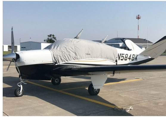
Beech Bonanza V35A Travel Canopy/Engine Cover Beech Bonanza/Debonair Travel Cover, Light Weight Travel Canopy Cover