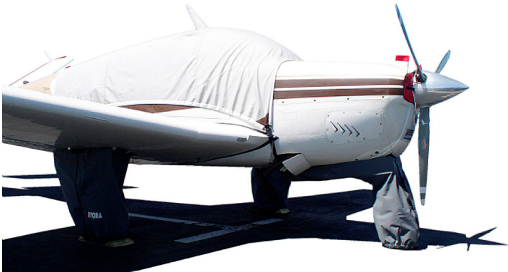
Beech Bonanza/Debonair/Baron Landing Gear Covers

ALL-YEAR USE MATERIAL - Made with Silver Acrylic Sunbrella canvas, the all-year use material is the best option for sun protection and cover longevity. This heavier more durable material is intended for all weather conditions, such as rain and snow or lots of sun.