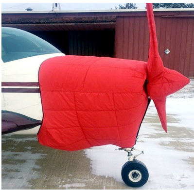
Bonanza Insulated Engine and Prop Cover