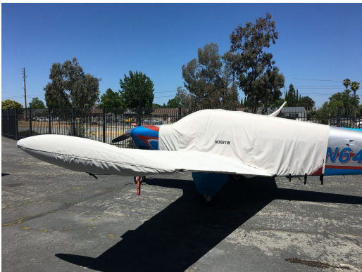
Beech Bonanza A36 Wing Covers with D'Shannon Tip Tanks, Extended Canopy Cover