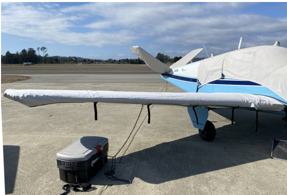
BEECH J35 WING COVERS