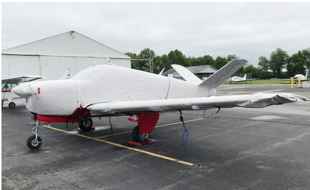
Beech Bonanza/Debonair Extended Canopy Cover (Specify Lg Or Sm Windshield & Lg Or Sm 3rd Window)

WINTER USE MATERIAL - Made with Solution-Dyed Polyester fabric, this option is intended for seasonal use to aid in deicing, rain mitigation, or for occasional travel. The material is lighter and more compact, but more susceptible to UV damage and may have a shorter useful life if used continuously outside than the all-year use material.