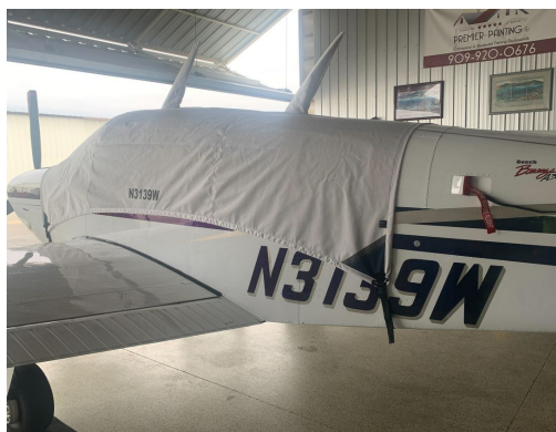
Beech A36 Canopy Cover