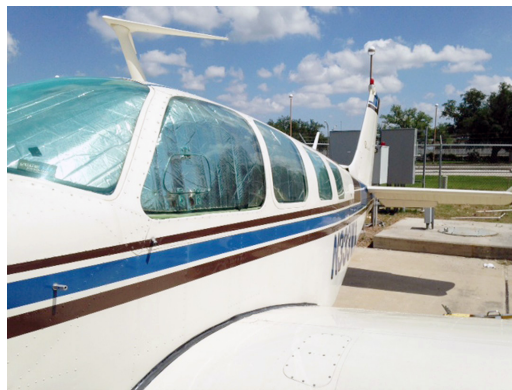
Beech Bonanza HeatShields