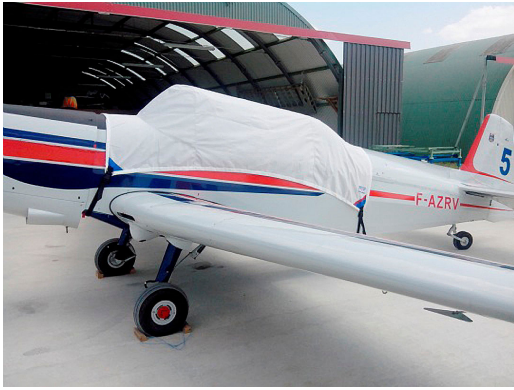
Zlin 526 Canopy Cover

the hottest of days. It is water, ice and snow repellent, yet breathable to allow moisture to escape from between the cover and the aircraft surface.