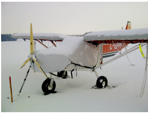
Zenith 701 Canopy, Wing, Tail & Insulated Engine Covers