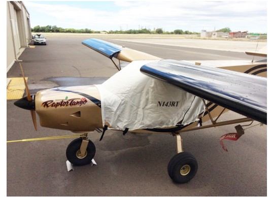
Zenith 701 Standard Canopy Cover