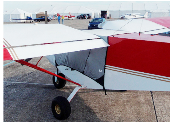
Zenith 701 Spandex FlyAway Travel Canopy Cover