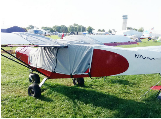
Zenith 701 Travel Canopy with wing extensions to cover gas caps.

the hottest of days. It is water, ice and snow repellent, yet breathable to allow moisture to escape from between the cover and the aircraft surface.