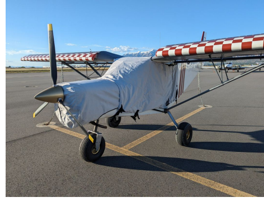
Zenith 701 Canopy, Wing, Tail & Insulated Engine Covers Zenair 701 Extended Canopy Cover (Over-the Top Style), Engine Cover