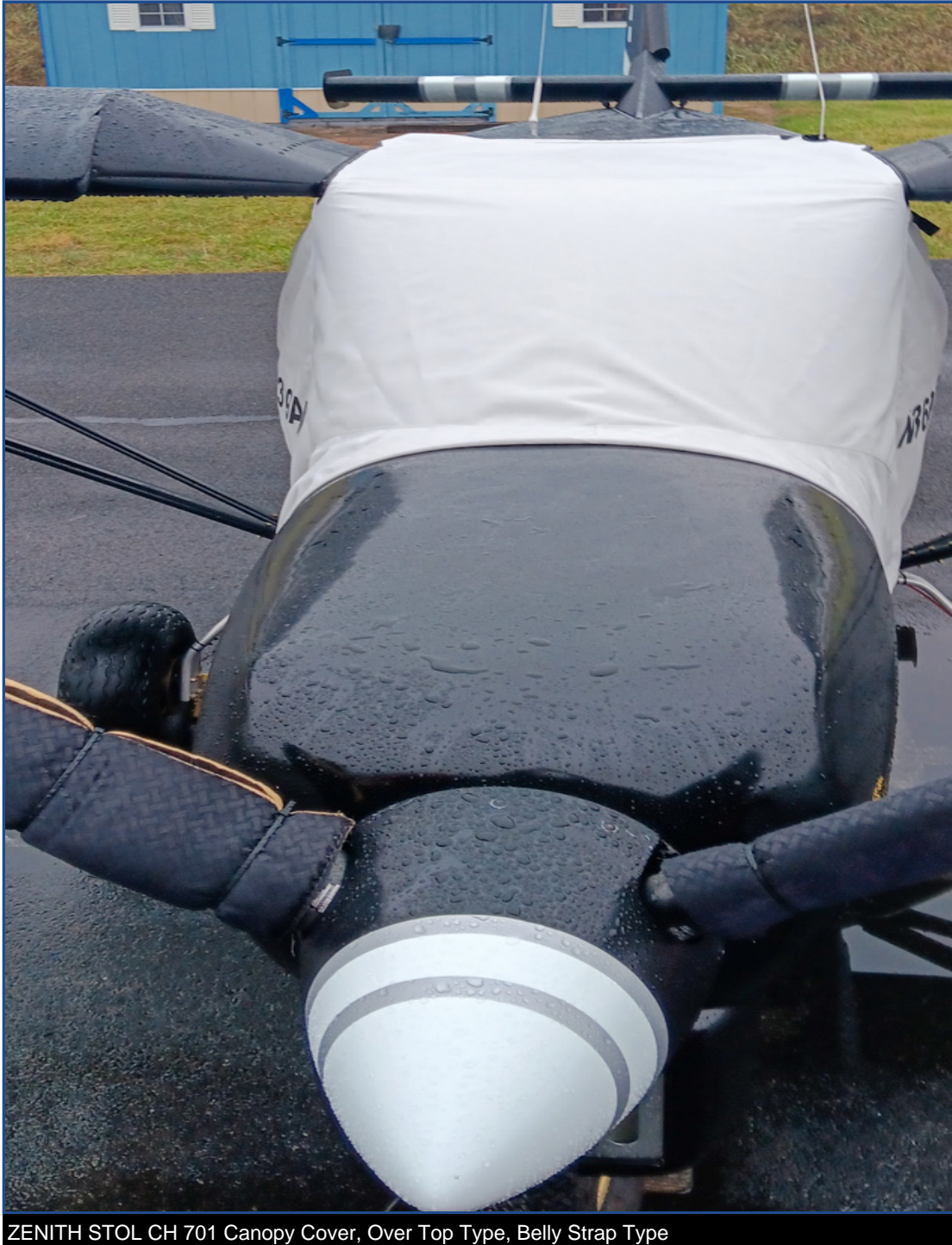
ZENITH STOL CH 701 Canopy Cover, Over Top Type, Belly Strap Type