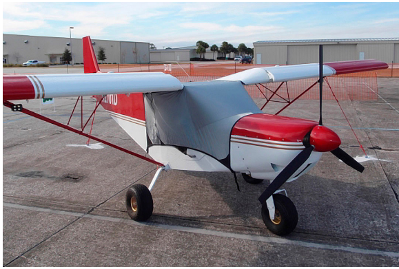
Zenith 701 Spandex FlyAway Travel Canopy Cover