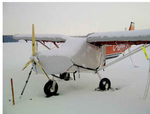
Zenith 701 Canopy, Wing, Tail & Insulated Engine Covers