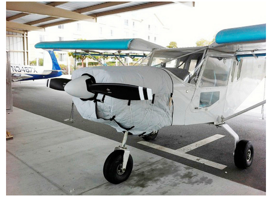
Zenith 801 Insulated Engine Cover