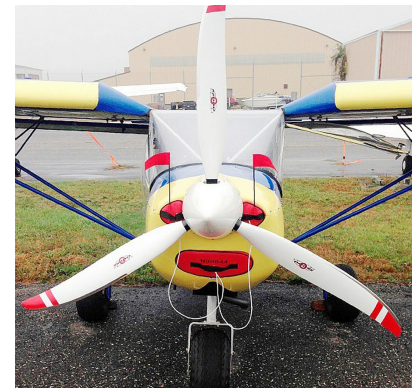
Zenith 701 Engine Inlet Plugs