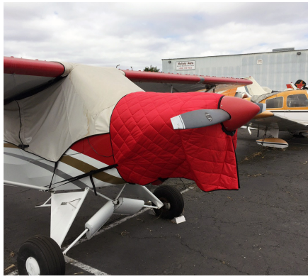
FOR INTERIOR USE. Cub Crafters CC-11 Insulated Hangar Blanket, available in Red or Silver