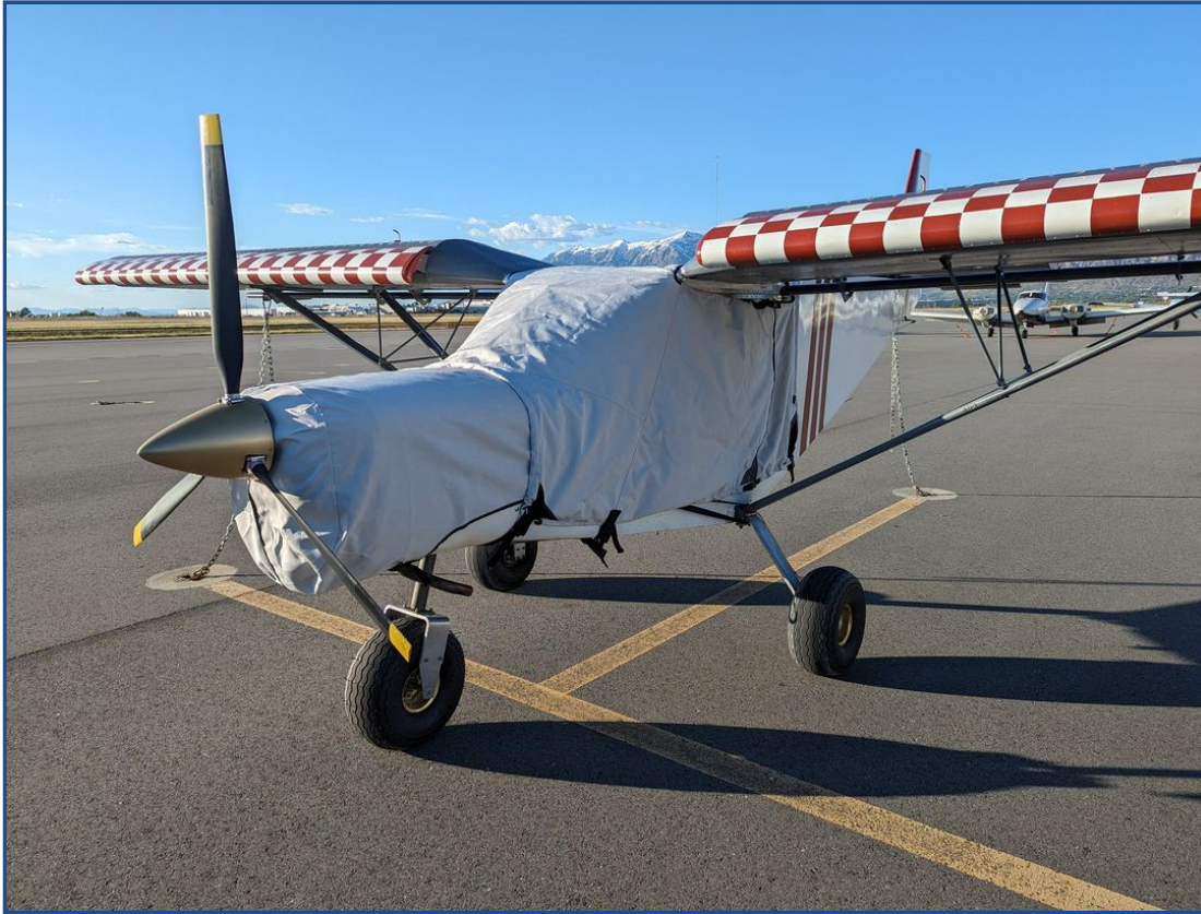
Zenith 701 Extended Canopy Cover (Over-the Top Style), Engine Cover