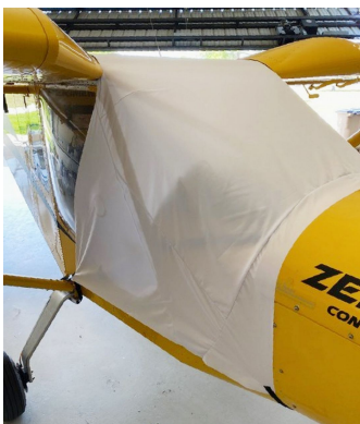
Zenith 750 Windshield Cover

This cover type is made from Silver Acrylic Sunbrella canvas and is 100% lined with a soft and smooth microfiber. Bruce's Custom Covers developed this material combination especially for aircraft protection. The outer material is medium weight and treated for water resistance, UV resistance and anti-static buildup. The inner lining is a very soft and smooth microfiber to prevent scratching. The material is very reflective, and tests show that the cabin interior temperature can be reduced to near-ambient temperature on the hottest of days. It is water, ice and snow repellent, yet breathable to allow moisture to escape from between the cover and the aircraft surface.