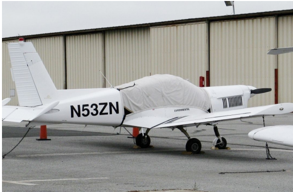
Zlin 142 Canopy Cover

The Zlin 42 Canopy/Engine Cover is a one-piece cover (100% lined with microfiber) that is a combination of the Canopy Cover and Engine Cover. This cover will enclose the engine cowl and will extend aft to cover all of the windows. This cover type is made from Silver Acrylic Sunbrella canvas and is 100% lined with a soft and smooth microfiber. Bruce's Custom Covers developed this material combination especially for aircraft protection. The outer material is medium weight and treated for water resistance, UV resistance and anti-static buildup. The inner lining is a very soft and smooth microfiber to prevent scratching. The material is very reflective, and tests show that the cabin interior temperature can be reduced to near-ambient temperature on the hottest of days. It is water, ice and snow repellent, yet breathable to allow moisture to escape from between the cover and the aircraft surface.