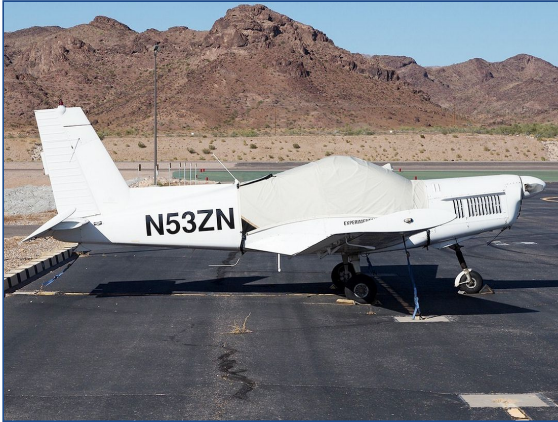
Zlin 142 Canopy Cover