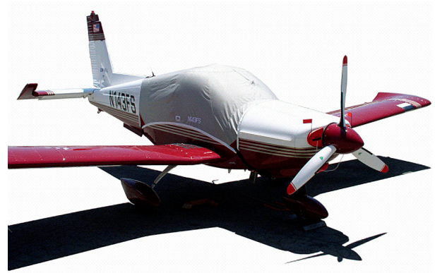
Zlin 143 Canopy Cover and Engine Plugs