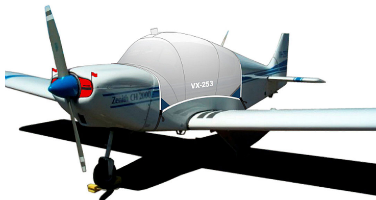
AMD Alarus CH2000 Std Canopy Cover & Engine Plugs (Illustration)

This cover type is made from Silver Acrylic Sunbrella canvas and is 100% lined with a soft and smooth microfiber. Bruce's Custom Covers developed this material combination especially for aircraft protection. The outer material is medium weight and treated for water resistance, UV resistance and anti-static buildup. The inner lining is a very soft and smooth microfiber to prevent scratching. The material is very reflective, and tests show that the cabin interior temperature can be reduced to near-ambient temperature on the hottest of days. It is water, ice and snow repellent, yet breathable to allow moisture to escape from between the cover and the aircraft surface.