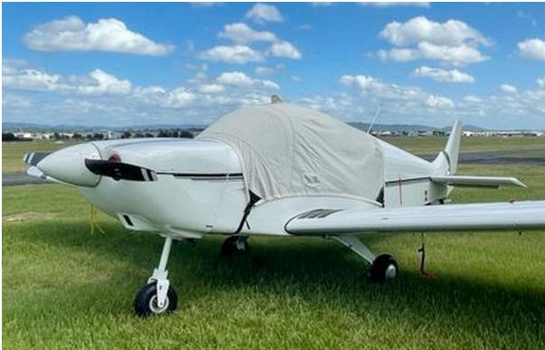
Zenith CH-2000, CH-640 Canopy Cover

This cover type is made from Silver Acrylic Sunbrella canvas and is 100% lined with a soft and smooth microfiber. Bruce's Custom Covers developed this material combination especially for aircraft protection. The outer material is medium weight and treated for water resistance, UV resistance and anti-static buildup. The inner lining is a very soft and smooth microfiber to prevent scratching. The material is very reflective, and tests show that the cabin interior temperature can be reduced to near-ambient temperature on the hottest of days. It is water, ice and snow repellent, yet breathable to allow moisture to escape from between the cover and the aircraft surface.