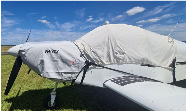
Zenith CH-2000 Canopy & Engine Covers

This cover type is made from Silver Acrylic Sunbrella canvas and is 100% lined with a soft and smooth microfiber. Bruce's Custom Covers developed this material combination especially for aircraft protection. The outer material is medium weight and treated for water resistance, UV resistance and anti-static buildup. The inner lining is a very soft and smooth microfiber to prevent scratching. The material is very reflective, and tests show that the cabin interior temperature can be reduced to near-ambient temperature on the hottest of days. It is water, ice and snow repellent, yet breathable to allow moisture to escape from between the cover and the aircraft surface.