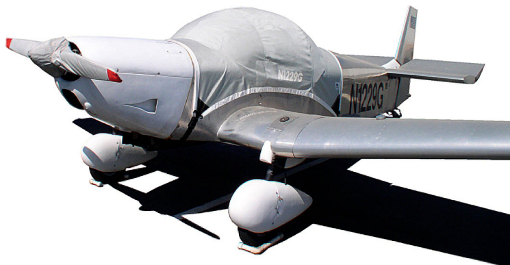
Zenith CH601 Canopy Cover & Prop Cover

This cover type is made from Silver Acrylic Sunbrella canvas and is 100% lined with a soft and smooth microfiber. Bruce's Custom Covers developed this material combination especially for aircraft protection. The outer material is medium weight and treated for water resistance, UV resistance and anti-static buildup. The inner lining is a very soft and smooth microfiber to prevent scratching. The material is very reflective, and tests show that the cabin interior temperature can be reduced to near-ambient temperature on the hottest of days. It is water, ice and snow repellent, yet breathable to allow moisture to escape from between the cover and the aircraft surface.