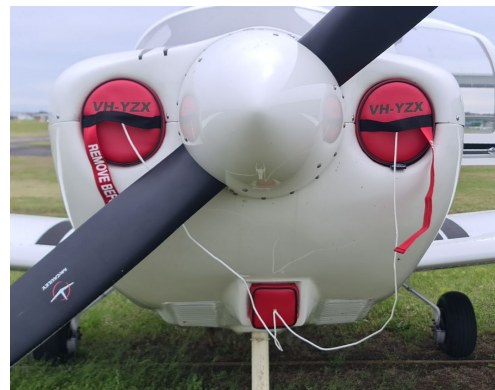
Zenith CH-2000, CH-640 Engine Inlet Plugs