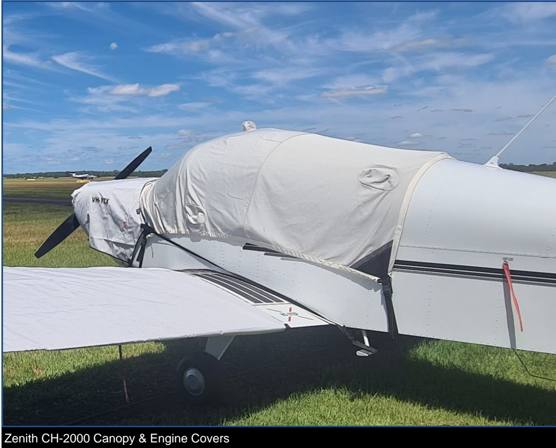
Zenith CH-2000 Canopy &amp; Engine Covers