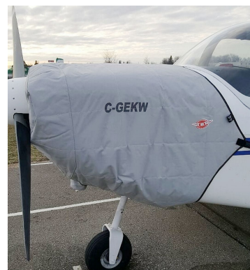
Zenith CH-2000 Insulated Engine Cover