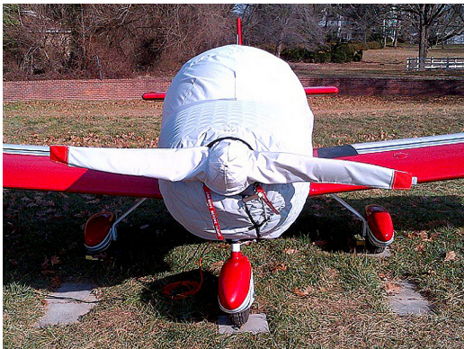
Cessna 172 2-blade Insulated Propellor/Spinner Cover