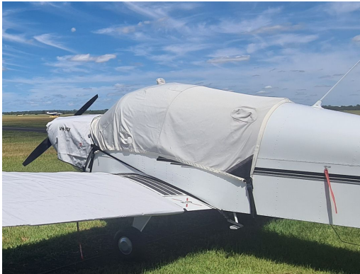
Zenith CH-2000 Canopy & Engine Covers