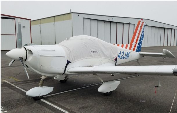
Zlin 242 Canopy Cover