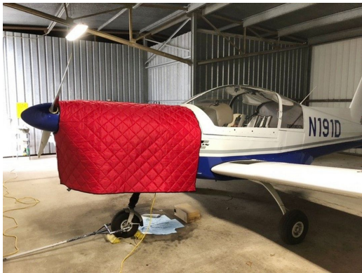
Zlin 142 Insulated Hangar Blanket

This cover type is made from Silver Acrylic Sunbrella canvas and is 100% lined with a soft and smooth microfiber. Bruce's Custom Covers developed this material combination especially for aircraft protection. The outer material is medium weight and treated for water resistance, UV resistance and anti-static buildup. The inner lining is a very soft and smooth microfiber to prevent scratching. The material is very reflective, and tests show that the cabin interior temperature can be reduced to near-ambient temperature on the hottest of days. It is water, ice and snow repellent, yet breathable to allow moisture to escape from between the cover and the aircraft surface.