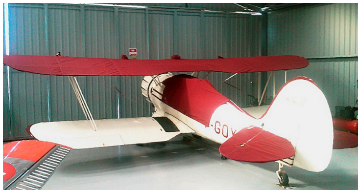
Waco UPF-7 Upper Wing Cover, Horizontal Stabilizer Cover &amp; Canopy Cover