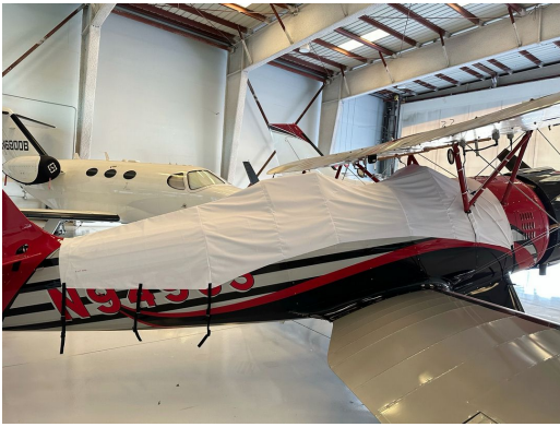
Waco YMF-5 Canopy with Turtledeck Extension, test fit cover