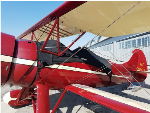
Waco UPF-7 Canopy Cover

This cover type is made from Silver Acrylic Sunbrella canvas and is 100% lined with a soft and smooth microfiber. Bruce's Custom Covers developed this material combination especially for aircraft protection. The outer material is medium weight and treated for water resistance, UV resistance and anti-static buildup. The inner lining is a very soft and smooth microfiber to prevent scratching. The material is very reflective, and tests show that the cabin interior temperature can be reduced to near-ambient temperature on the hottest of days. It is water, ice and snow repellent, yet breathable to allow moisture to escape from between the cover and the aircraft surface.