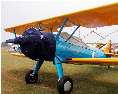
Stearman Canopy, Engine & Prop Covers

This cover type is made from Silver Acrylic Sunbrella canvas and is 100% lined with a soft and smooth microfiber. Bruce's Custom Covers developed this material combination especially for aircraft protection. The outer material is medium weight and treated for water resistance, UV resistance and anti-static buildup. The inner lining is a very soft and smooth microfiber to prevent scratching. The material is very reflective, and tests show that the cabin interior temperature can be reduced to near-ambient temperature on the hottest of days. It is water, ice and snow repellent, yet breathable to allow moisture to escape from between the cover and the aircraft surface.