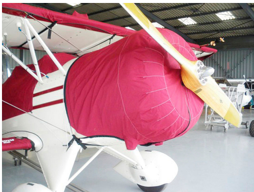
Waco UPF-7 Engine Cover

WINTER USE MATERIAL - Made with Solution-Dyed Polyester fabric, this option is intended for seasonal use to aid in deicing, rain mitigation, or for occasional travel. The material is lighter and more compact, but more susceptible to UV damage and may have a shorter useful life if used continuously outside than the all-year use material.