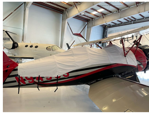
Waco YMF-5 Canopy with Turtledeck Extension, test fit cover