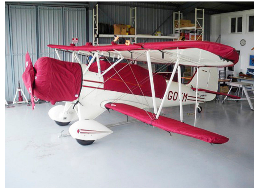
Waco UPF-7 Canopy, Wings, Stab's, Engine, Prop Covers