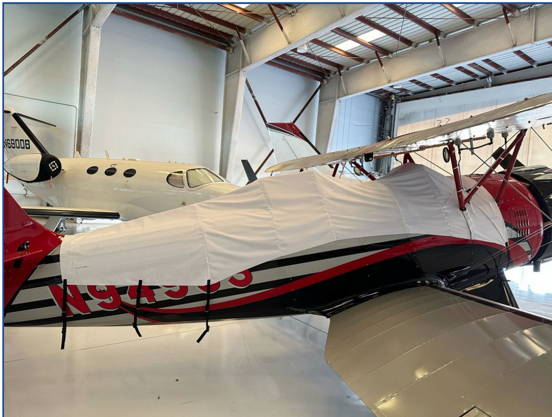
Waco YMF-5 Canopy with Turtledeck Extension, test fit cover