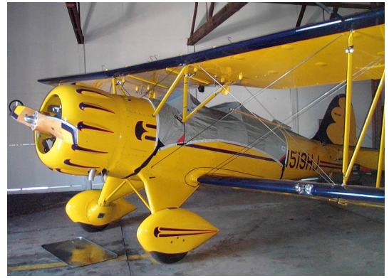
Waco YMF Canopy Cover