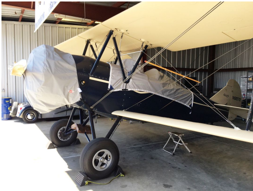
Travel Air 4000 Canopy and Engine Covers, light weight travel type