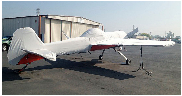
Yak 55 Full Fuselage Cover w/ Detachable Wing Covers & Propellor/Spinner Cover