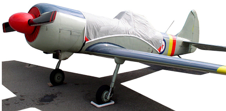
Yak 50 Canopy Cover

reflective, and tests show that the cabin interior temperature can be reduced to near-ambient temperature on the hottest of days. It is water, ice and snow repellent, yet breathable to allow moisture to escape from between the cover and the aircraft surface.