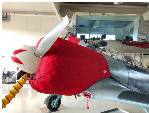
Yak 11 Insulated Engine Cover & Oil Cooler Inlet Plug