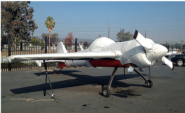
Yak 55 Full Fuselage Cover w/ Detachable Wing Covers & Propellor/Spinner Cover