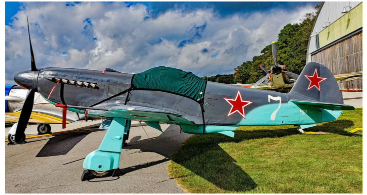
Yakovlev Yak 3 Canopy Cover (3u Models: Longer Canopy)