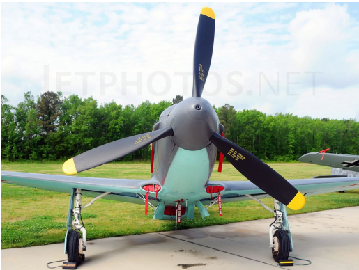
Yakovlev Yak 3 Belly Scoop Plug