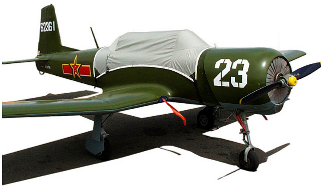
CJ-6 Nanchang Canopy Cover