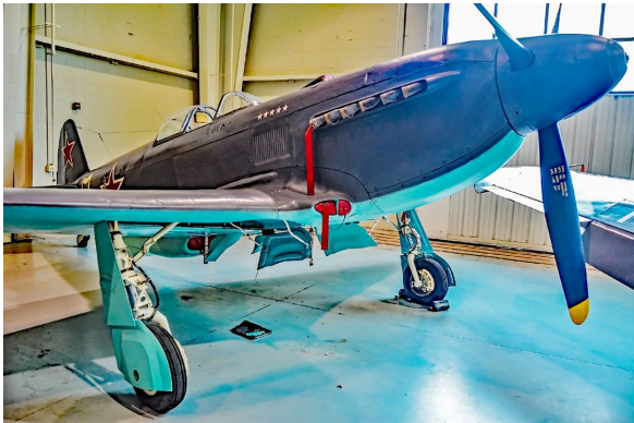
Yakovlev Yak 3 Oil Cooler Inlet Plugs (In Wing Root), Belly Scoop Plug

Engine Inlet Plugs are custom fit for your Yakovlev Yak 3 intakes, made with heavy-duty vinyl material, and stuffed with a single block of sculpted urethane foam. Each plug has a zipper that allows the foam to be removed and dried if necessary. Engine plugs have warning flags that are visible from the cockpit or 'remove before flight' streamers sewn onto the face of the plugs. Most plugs are imprinted with the aircraft registration number in black for an extra charge. Storage bag NOT included. Engine plugs may be inserted after flight when the engine is still warm. Engine Inlet Plugs are commonly referred to as Cowl Plugs, Intake Plugs, Cowl Blocks, Engine Blocks, and Engine Bungs.