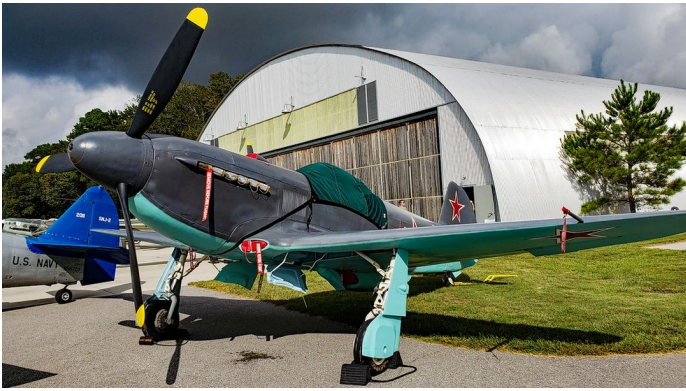
Yakovlev Yak 3 Oil Cooler Inlet Plugs (In Wing Root)