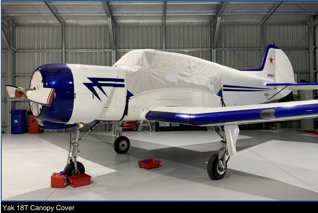
Yak 18T Canopy Cover