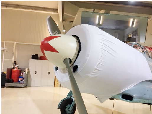
Yak 11 Engine Cover (test fit cover)