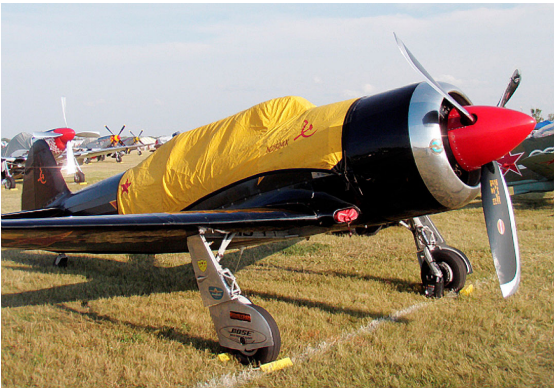
Yak 11 Canopy Cover, Plugs & Pitot Covers