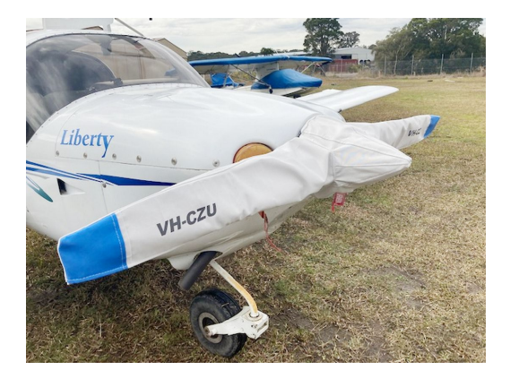
XL-2 PROPELLOR/SPINNER COVER

This cover type is made from Silver Acrylic Sunbrella canvas and is 100% lined with a soft and smooth microfiber. Bruce's Custom Covers developed this material combination especially for aircraft protection. The outer material is medium weight and treated for water resistance, UV resistance and anti-static buildup. The inner lining is a very soft and smooth microfiber to prevent scratching. The material is very reflective, and tests show that the cabin interior temperature can be reduced to near-ambient temperature on the hottest of days. It is water, ice and snow repellent, yet breathable to allow moisture to escape from between the cover and the aircraft surface.