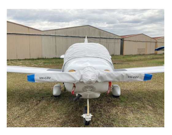
XL-2 PROPELLOR/SPINNER COVER