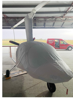
Celier Argon 915 Canopy/Nose Cover, Rotor Mast Cover, test fit covers