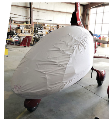
Cavalon Gyrocopter Bubble Cover, test fit cover