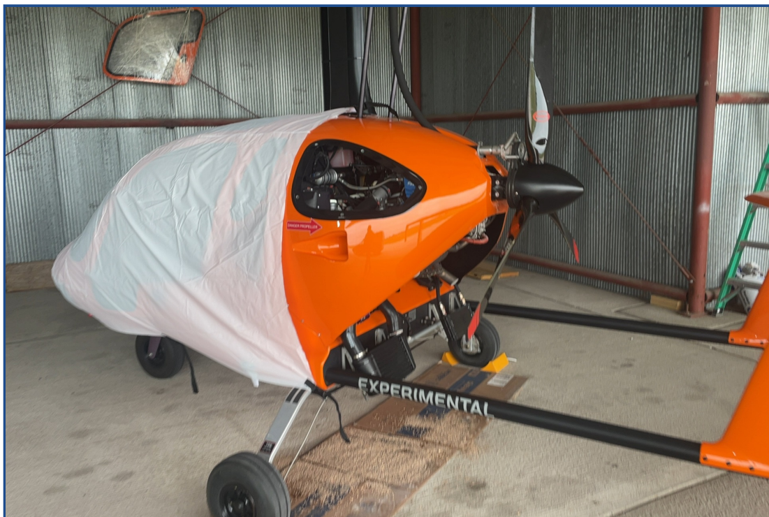
Celier Argon 915 Canopy/Nose Cover, test fit cover