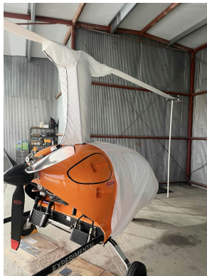
Celier Argon 915 Canopy/Nose Cover, Rotor Mast Cover, test fit covers

Bruce's Celier Xenon, Argon Gyrocopter Blade Covers are made of medium-weight Solution-Dyed Polyester and designed to avoid trim tabs or wicks. You can install Blade Covers from the ground with the aid of a lightweight rope attached to the open end. Covers are cinched tight at the blade root with straps and quick-release plastic buckles. The Cold Weather Blade Covers are fitted with full-length zippers and optional deice "boots" designed to accept a preheater hose; a small opening at the tip of the cover allows for some air circulation and drainage in freezing weather. Some part numbers have features for an extra charge.