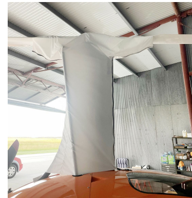
Celier Argon 915 Rotor Mast Cover, test fit cover