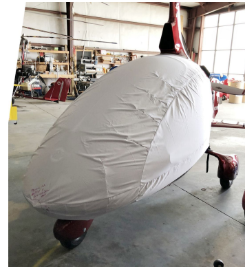
Cavalon Gyrocopter Bubble Cover, test fit cover