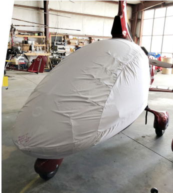
Cavalon Gyrocopter Bubble Cover, test fit cover

feature with which they can be tightened to help prevent abrasive chafing of the windshield. Pockets are sewn into the cover for the temperature probe and pitot tubes. The bubble cover is reinforced with patches at hinge points, door handles, and for the windshield wipers. For ease of installation, the bubble cover is color-coded (red=left, green=right) with color swatches sewn into the corners. This cover type is made from Silver Acrylic Sunbrella canvas and is 100% lined with a soft and smooth microfiber. Bruce's Custom Covers developed this material combination especially for aircraft protection. The outer material is medium weight and treated for water resistance, UV resistance and anti-static buildup. The inner lining is a very soft and smooth microfiber to prevent scratching. The material is very reflective, and tests show that the cabin interior temperature can be reduced to near-ambient temperature on the hottest of days. It is water, ice and snow repellent, yet breathable to allow moisture to escape from between the cover and the aircraft surface.