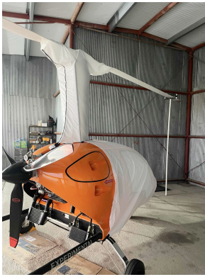
Celier Argon 915 Canopy/Nose Cover, Rotor Mast Cover, test fit covers