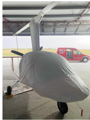
Celier Argon 915 Canopy/Nose Cover, Rotor Mast Cover, test fit covers