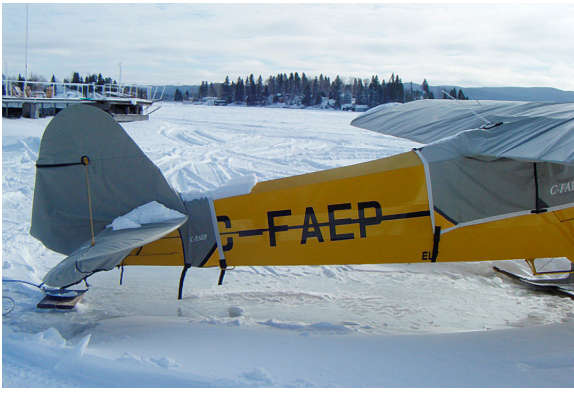
Piper J3 Cub Abbreviated Empennage Cover, Wing Covers and Canopy Cover