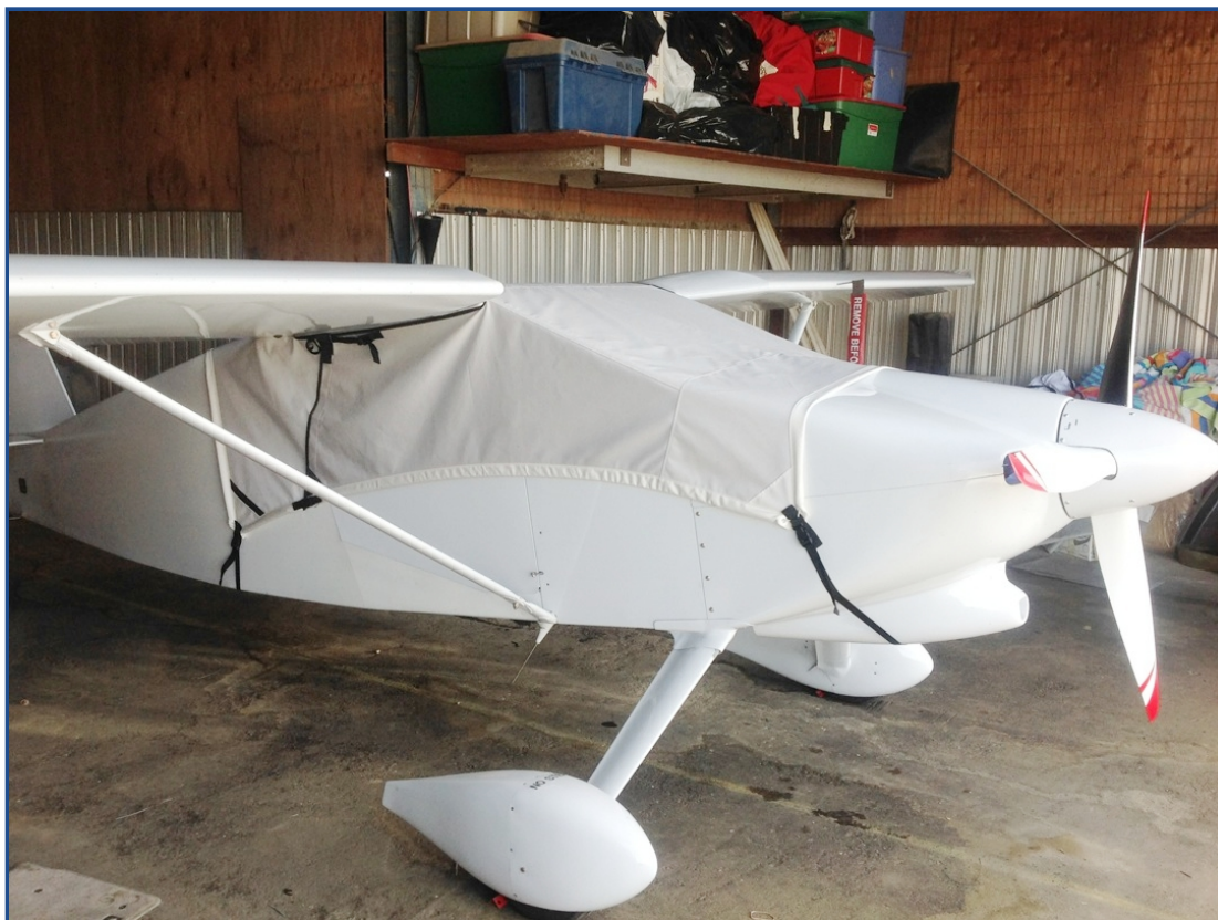
Wittman Tailwind Canopy Cover