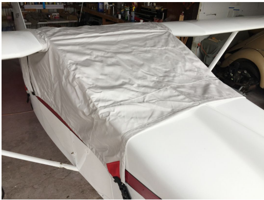
Wittman Tailwind Canopy Cover, Over-The-Top