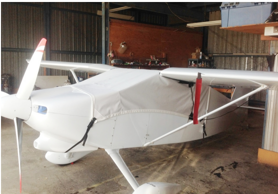
Wittman Tailwind Canopy Cover

This cover type is made from Silver Acrylic Sunbrella canvas and is 100% lined with a soft and smooth microfiber. Bruce's Custom Covers developed this material combination especially for aircraft protection. The outer material is medium weight and treated for water resistance, UV resistance and anti-static buildup. The inner lining is a very soft and smooth microfiber to prevent scratching. The material is very reflective, and tests show that the cabin interior temperature can be reduced to near-ambient temperature on the hottest of days. It is water, ice and snow repellent, yet breathable to allow moisture to escape from between the cover and the aircraft surface.