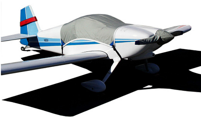
Canopy Cover, Prop Cover

This cover type is made from Silver Acrylic Sunbrella canvas and is 100% lined with a soft and smooth microfiber. Bruce's Custom Covers developed this material combination especially for aircraft protection. The outer material is medium weight and treated for water resistance, UV resistance and anti-static buildup. The inner lining is a very soft and smooth microfiber to prevent scratching. The material is very reflective, and tests show that the cabin interior temperature can be reduced to near-ambient temperature on the hottest of days. It is water, ice and snow repellent, yet breathable to allow moisture to escape from between the cover and the aircraft surface.