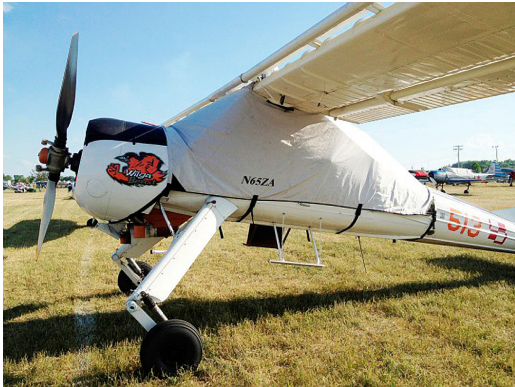
Wilga Canopy Cover

water resistance, UV resistance and anti-static buildup. The inner lining is a very soft and smooth microfiber to prevent scratching. The material is very reflective, and tests show that the cabin interior temperature can be reduced to near-ambient temperature on the hottest of days. It is water, ice and snow repellent, yet breathable to allow moisture to escape from between the cover and the aircraft surface.