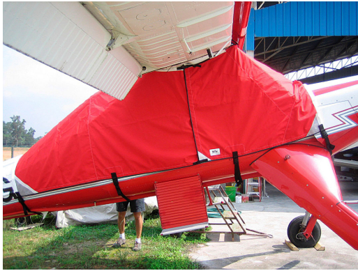
Wilga Canopy Cover

water resistance, UV resistance and anti-static buildup. The inner lining is a very soft and smooth microfiber to prevent scratching. The material is very reflective, and tests show that the cabin interior temperature can be reduced to near-ambient temperature on the hottest of days. It is water, ice and snow repellent, yet breathable to allow moisture to escape from between the cover and the aircraft surface.