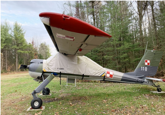
PZL Wilga Canopy Cover, Wrap-Around Type