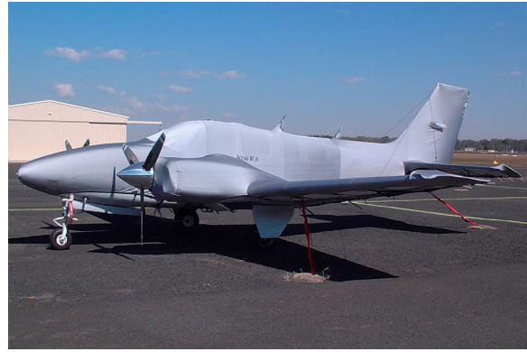
Baron FULL COVER SET, Light Weight Travel &/or Fitted Dust Cover Set