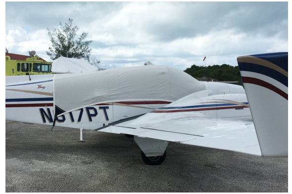
Beech Baron 58 Canopy Cover