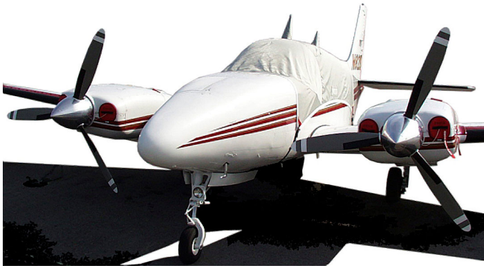
Baron 58 Standard Canopy Cover & Engine Plugs