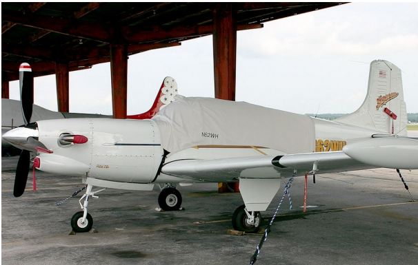
Beech Harpoon Canopy Cover, Exhaust Covers, Engine Plug

Prop Tie-Down/Exhaust Covers are made of heavy duty red vinyl material. Thick nylon webbing runs from the exhaust covers to the prop boot. This webbing is adjustable with plastic buckles, and is held tight with a steel spring where it attaches to the prop boot.