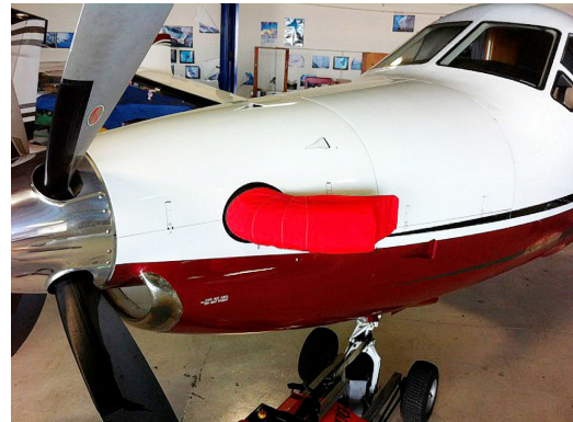
Pilatus PC-12 Exhaust Cover, Fully Enclosed, for protection against corrosion.