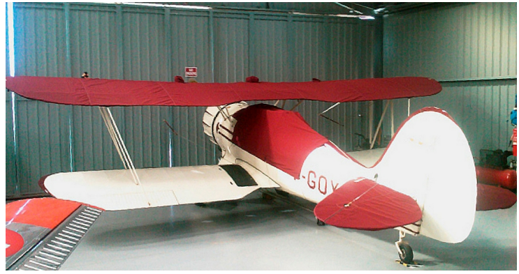
Waco UPF-7 Upper Wing Cover, Horizontal Stabilizer Cover & Canopy Cover