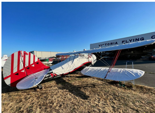
Waco YMF-5 Engine, Extended Canopy, Wing Covers & Horizontal Stab Covers