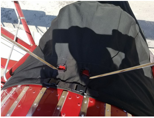
Waco UPF-7 Canopy Cover