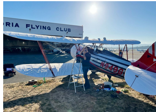
Waco YMF-5 Engine, Extended Canopy & Wing Covers Waco YMF-5 Engine, Extended Canopy, Wing Covers & Horizontal Stab Covers