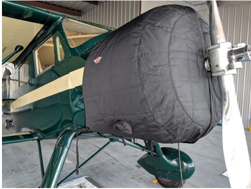
Wacon Cabin Biplane ZQC-6 Insulated Engine Cover