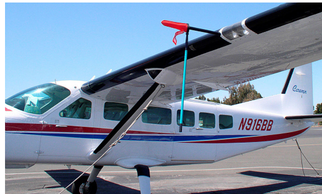
Cessna 208 Caravan Telescoping Pitot (for amphib. models)