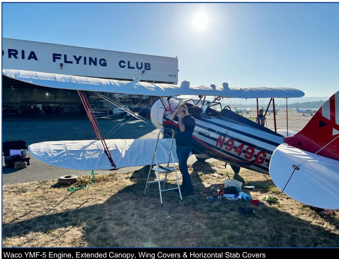
Waco YMF-5 Engine, Extended Canopy, Wing Covers &amp; Horizontal Stab Covers