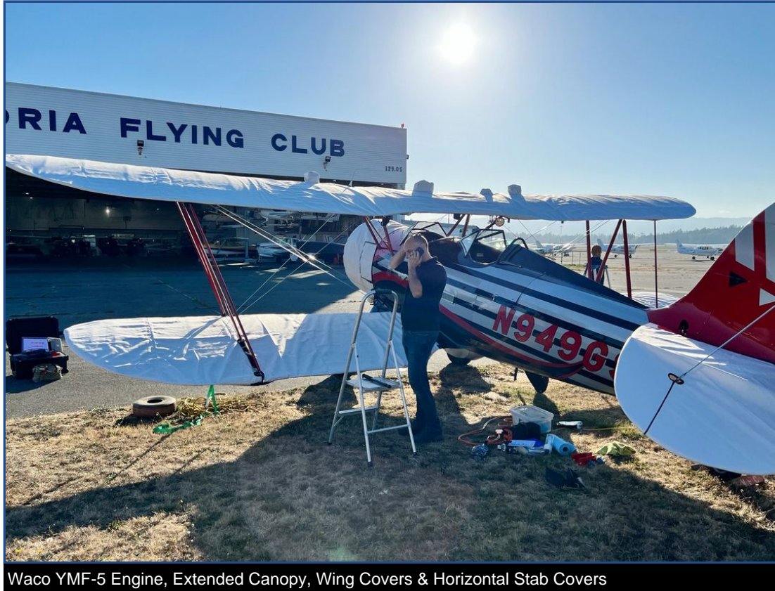
Waco YMF-5 Engine, Extended Canopy, Wing Covers & Horizontal Stab Covers