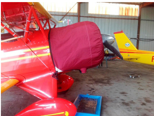
Waco Engine Cover

This cover type is made from Silver Acrylic Sunbrella canvas and is 100% lined with a soft and smooth microfiber. Bruce's Custom Covers developed this material combination especially for aircraft protection. The outer material is medium weight and treated for water resistance, UV resistance and anti-static buildup. The inner lining is a very soft and smooth microfiber to prevent scratching. The material is very reflective, and tests show that the cabin interior temperature can be reduced to near-ambient temperature on the hottest of days. It is water, ice and snow repellent, yet breathable to allow moisture to escape from between the cover and the aircraft surface.