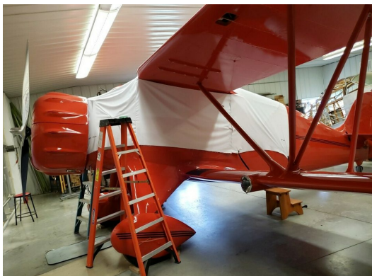
Waco YKC Canopy Cover, test fit cover