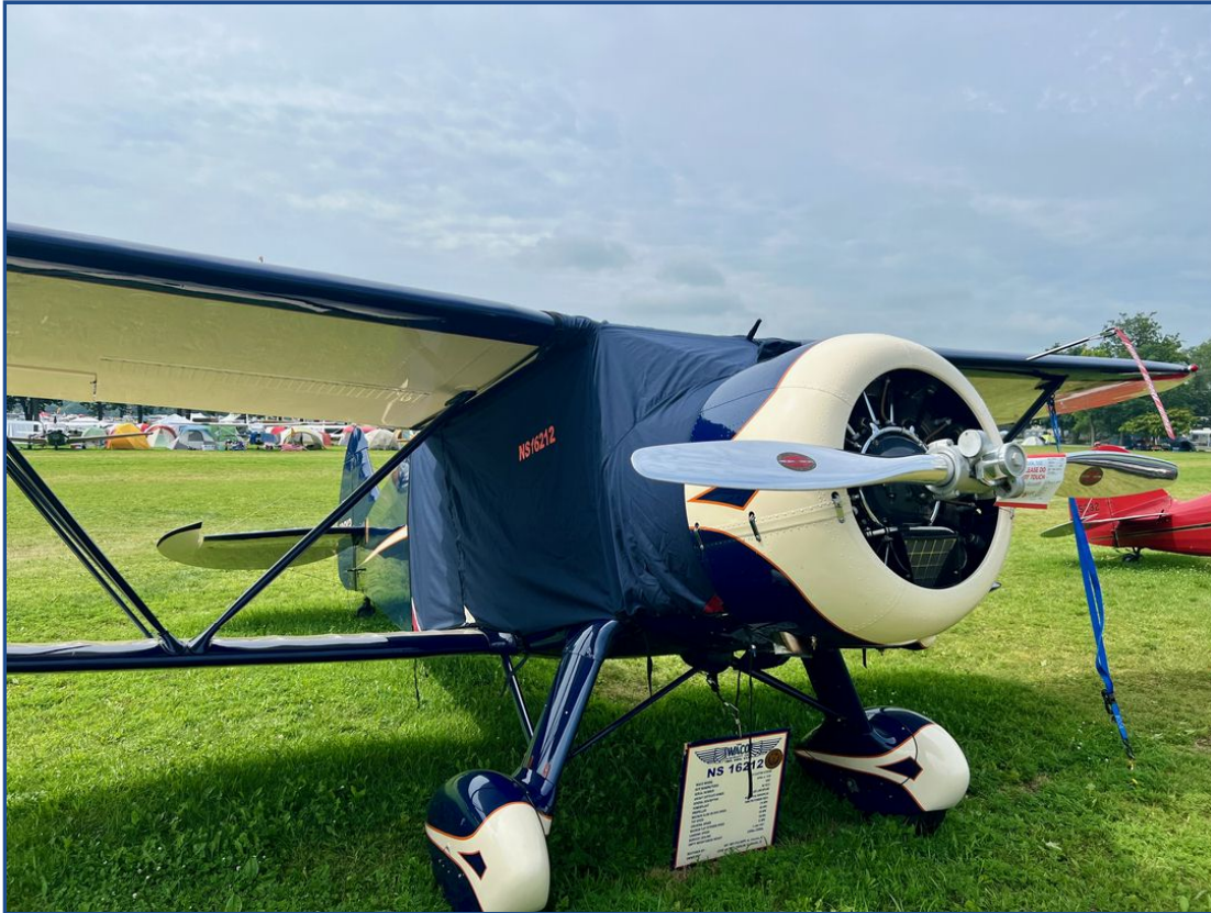
Waco YQC-6 Cabin Cover