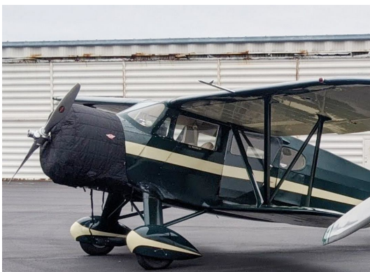
WACO ZQC-6 Insulated Engine Cover

This cover type is made from Silver Acrylic Sunbrella canvas and is 100% lined with a soft and smooth microfiber. Bruce's Custom Covers developed this material combination especially for aircraft protection. The outer material is medium weight and treated for water resistance, UV resistance and anti-static buildup. The inner lining is a very soft and smooth microfiber to prevent scratching. The material is very reflective, and tests show that the cabin interior temperature can be reduced to near-ambient temperature on the hottest of days. It is water, ice and snow repellent, yet breathable to allow moisture to escape from between the cover and the aircraft surface.