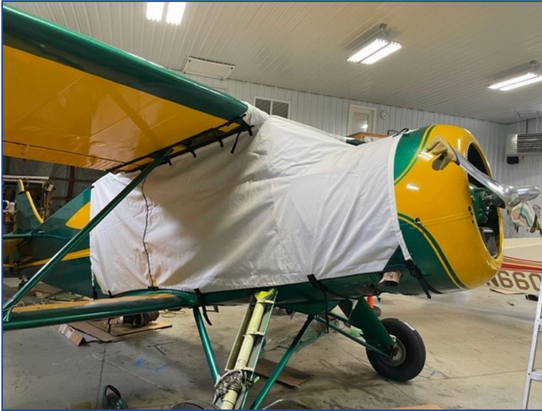
Waco Cabin Biplane Cabin Cover (Over Top Type), Ext. To Cover Baggage Door