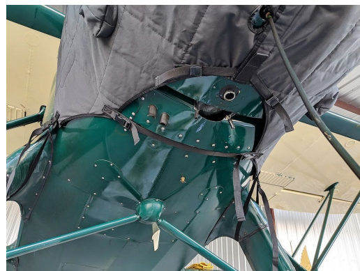
Wacon Cabin Biplane ZQC-6 Insulated Engine Cover