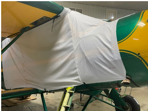
Waco ZGC-8 Canopy Cover, test fit cover