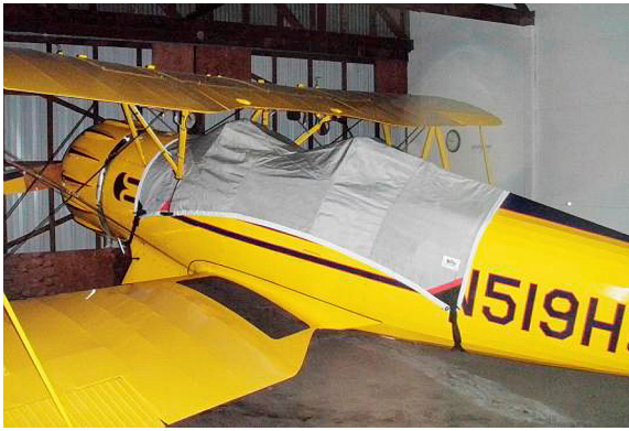
Waco YMF-5 Canopy Cover