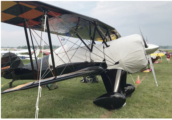
Waco Taperwing Cockpit & Engine Covers