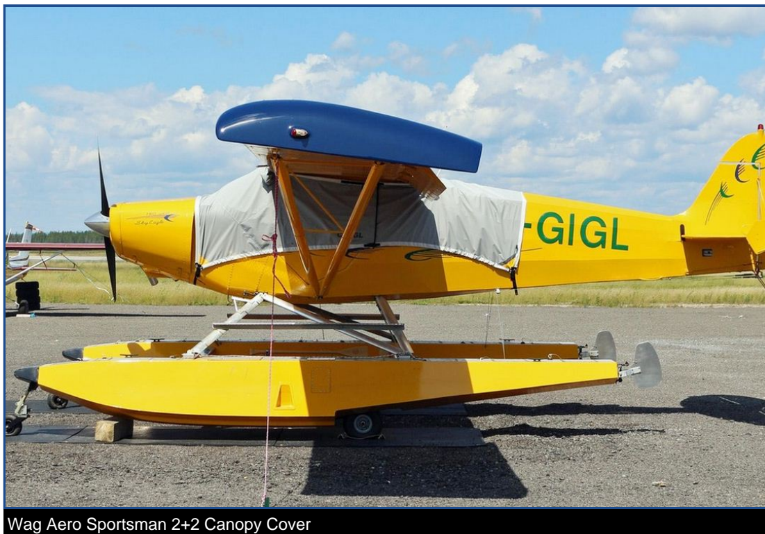
Wag Aero Sportsman 2+2 Canopy Cover