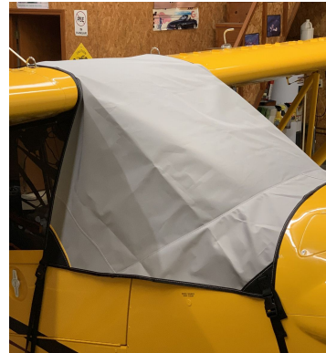
Piper PA-12 Super Cruiser Over-Top Canopy Cover Cub Crafters Carbon Cub FX3 Windshield/Skylight Cover, travel weight