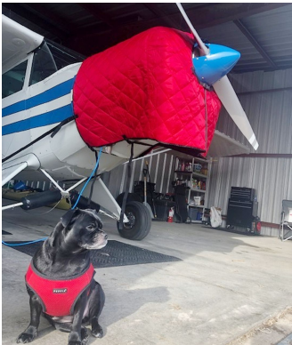
Piper PA-12 Insulated Hangar Blanket

This cover type is made from Silver Acrylic Sunbrella canvas and is 100% lined with a soft and smooth microfiber. Bruce's Custom Covers developed this material combination especially for aircraft protection. The outer material is medium weight and treated for water resistance, UV resistance and anti-static buildup. The inner lining is a very soft and smooth microfiber to prevent scratching. The material is very reflective, and tests show that the cabin interior temperature can be reduced to near-ambient temperature on the hottest of days. It is water, ice and snow repellent, yet breathable to allow moisture to escape from between the cover and the aircraft surface.