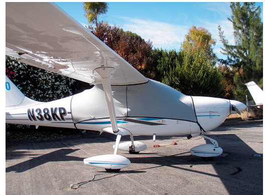
Glastar Spandex FlyAway Travel Canopy Cover