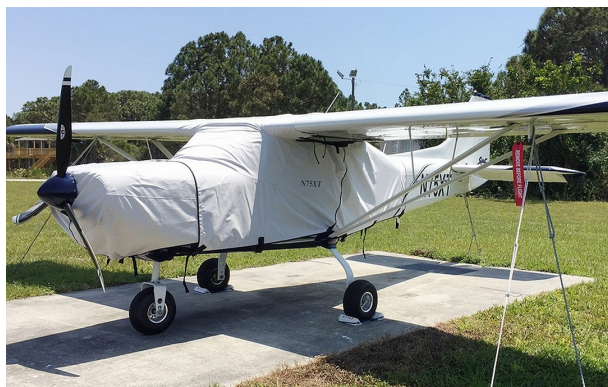
World Aircraft Extended Canopy Cover & Engine Cover

This cover type is made from Silver Acrylic Sunbrella canvas and is 100% lined with a soft and smooth microfiber. Bruce's Custom Covers developed this material combination especially for aircraft protection. The outer material is medium weight and treated for water resistance, UV resistance and anti-static buildup. The inner lining is a very soft and smooth microfiber to prevent scratching. The material is very reflective, and tests show that the cabin interior temperature can be reduced to near-ambient temperature on the hottest of days. It is water, ice and snow repellent, yet breathable to allow moisture to escape from between the cover and the aircraft surface.