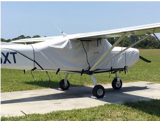
World Aircraft Extended Canopy Cover & Engine Cover

This cover type is made from Silver Acrylic Sunbrella canvas and is 100% lined with a soft and smooth microfiber. Bruce's Custom Covers developed this material combination especially for aircraft protection. The outer material is medium weight and treated for water resistance, UV resistance and anti-static buildup. The inner lining is a very soft and smooth microfiber to prevent scratching. The material is very reflective, and tests show that the cabin interior temperature can be reduced to near-ambient temperature on the hottest of days. It is water, ice and snow repellent, yet breathable to allow moisture to escape from between the cover and the aircraft surface.