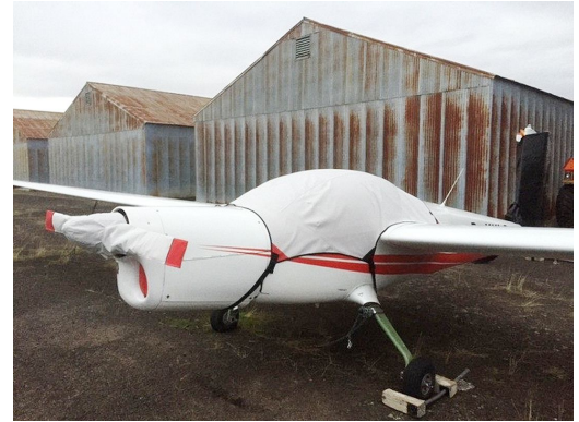
Vivat Canopy and Prop/Spinner Cover