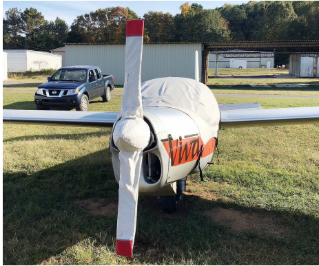
Aerotechnik L-13 Vivat Motorglider Prop/Spinner &amp; Canopy Covers