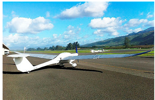
Lambada Canopy/Engine Cover and Wing Covers