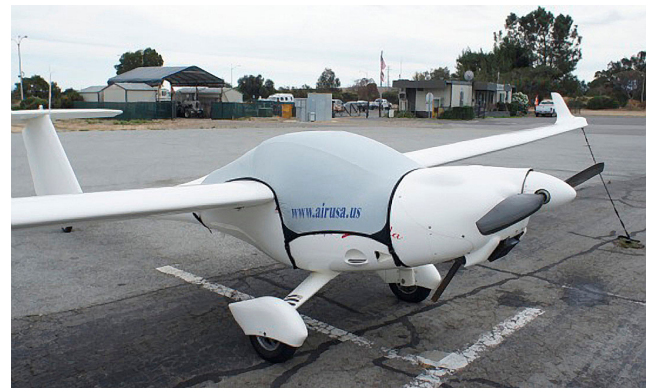
Lambada Travel Canopy Cover