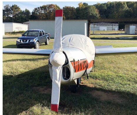
Aerotechnik L-13 Vivat Motorglider Prop/Spinner &amp; Canopy Covers