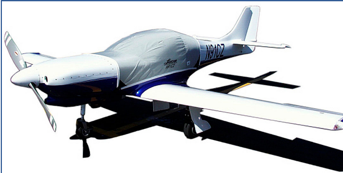
Canopy Cover for Lancair 320/360