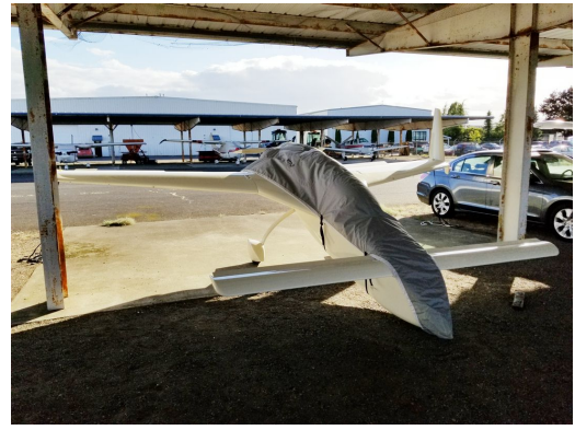
Rutan Vari EZ Travel Cover/Nose/Engine Cover