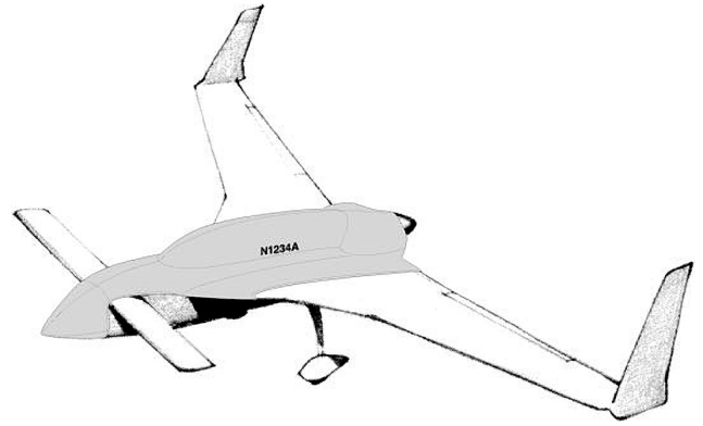
Rutan Long-EZ Canopy Cover