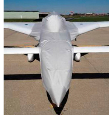
Long EZ Canopy/Nose/Engine Cover w/ Wing Extensions