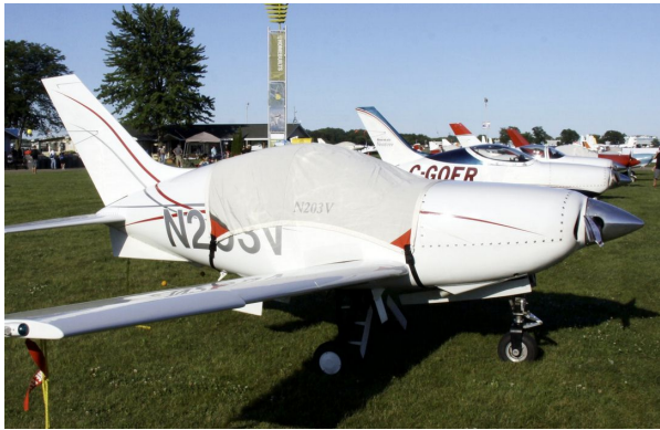
Questair Venture Canopy Cover