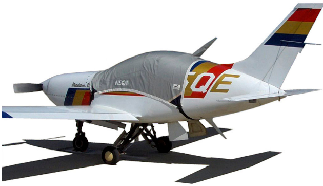
Questair Venture Canopy Cover