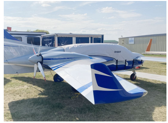
Twin Velocity Canopy/Nose Cover