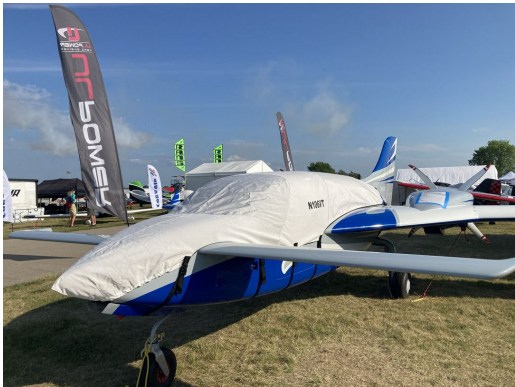
Twin Velocity Canopy/Nose Cover

Travel Covers are made with Silver Solution-Dyed Polyester fabric and only lined over the windshield to save weight. The material is lightweight and more compact for easy stowage in the aircraft. The polyester material is water resistant, but only intended for occasional use outside. We also have an ultra lightweight material available for fitted hangar dust covers. For daily outdoor use, the non-travel Sunbrella Cover is the best choice.