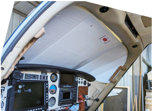
Velocity Windshield HeartShield

Heatshields are interior sunshades for an aircraft's windows or canopy glass. The product is a unique composite of closed-cell foam with a silver mylar finish. The semi-rigid design is stiff enough to stand along the inside of the windshield using sun visors or window framing. It folds up flat and easily stores in the included storage sleeve. Some designs may require velcro and suction cups. A Heatshield is an excellent short-term remedy for cockpit overheating.