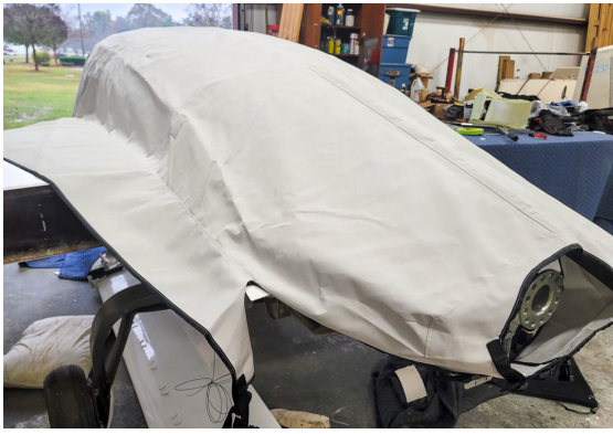
Velocity All Models: Standard, 173, XL Canopy/Nose/Engine Cover (6" Extension To Cover Wing Roots), Specify Model