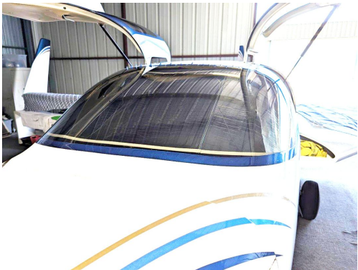
Velocity Windshield HeartShield