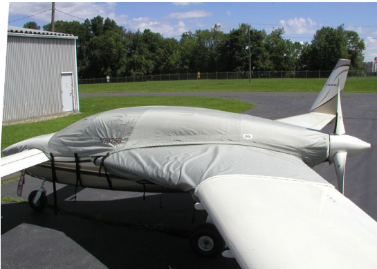
Velocity Canopy/Nose/Engine Cover, wing coverage varies