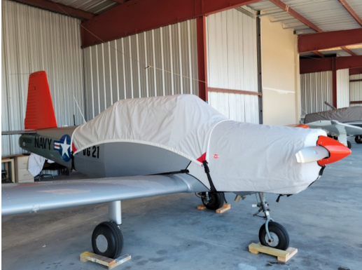
Varga Kachina Canopy & Engine Covers

This cover type is made from Silver Acrylic Sunbrella canvas and is 100% lined with a soft and smooth microfiber. Bruce's Custom Covers developed this material combination especially for aircraft protection. The outer material is medium weight and treated for water resistance, UV resistance and anti-static buildup. The inner lining is a very soft and smooth microfiber to prevent scratching. The material is very reflective, and tests show that the cabin interior temperature can be reduced to near-ambient temperature on the hottest of days. It is water, ice and snow repellent, yet breathable to allow moisture to escape from between the cover and the aircraft surface.