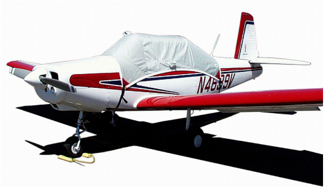
Canopy Cover for the Varga Kachina