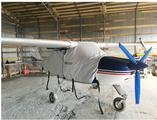
Tecnam P2004 Bravo Extended Canopy Cover, Over-Top Type

This cover type is made from Silver Acrylic Sunbrella canvas and is 100% lined with a soft and smooth microfiber. Bruce's Custom Covers developed this material combination especially for aircraft protection. The outer material is medium weight and treated for water resistance, UV resistance and anti-static buildup. The inner lining is a very soft and smooth microfiber to prevent scratching. The material is very reflective, and tests show that the cabin interior temperature can be reduced to near-ambient temperature on the hottest of days. It is water, ice and snow repellent, yet breathable to allow moisture to escape from between the cover and the aircraft surface.