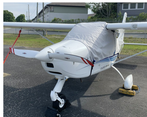
Tecnam P92 EAGLET Canopy Cover Over theTop Style