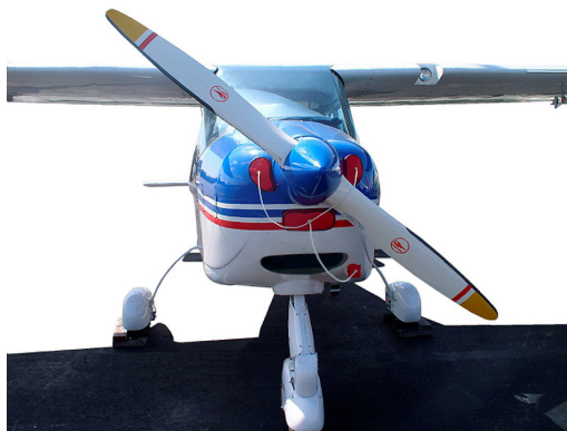
Tecnam Bravo Engine Plugs

Engine Inlet Plugs are custom fit for your Vulcanair V1.0 intakes, made with heavy-duty vinyl material, and stuffed with a single block of sculpted urethane foam. Each plug has a zipper that allows the foam to be removed and dried if necessary. Engine plugs have warning flags that are visible from the cockpit or 'remove before flight' streamers sewn onto the face of the plugs. Most plugs are imprinted with the aircraft registration number in black for an extra charge. Storage bag NOT included. Engine plugs may be inserted after flight when the engine is still warm. Engine Inlet Plugs are commonly referred to as Cowl Plugs, Intake Plugs, Cowl Blocks, Engine Blocks, and Engine Bungs.