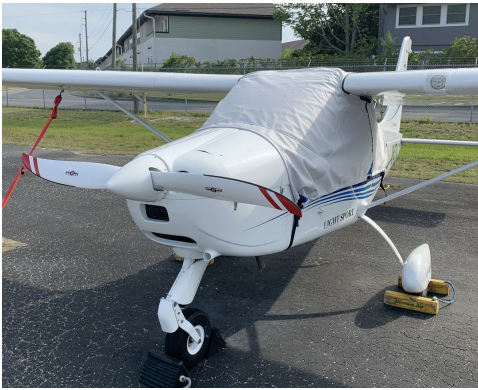
Tecnam P92 EAGLET Canopy Cover Over theTop Style