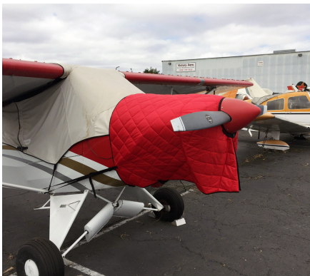
FOR INTERIOR USE. Cub Crafters CC-11 Insulated Hangar Blanket, available in Red or Silver

This cover type is made from Silver Acrylic Sunbrella canvas and is 100% lined with a soft and smooth microfiber. Bruce's Custom Covers developed this material combination especially for aircraft protection. The outer material is medium weight and treated for water resistance, UV resistance and anti-static buildup. The inner lining is a very soft and smooth microfiber to prevent scratching. The material is very reflective, and tests show that the cabin interior temperature can be reduced to near-ambient temperature on the hottest of days. It is water, ice and snow repellent, yet breathable to allow moisture to escape from between the cover and the aircraft surface.