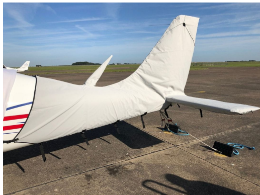
Tecnam P2008 Empennage Cover (Tailboom, Vertical & Horizontal Stabilizers), All Year Use

WINTER USE MATERIAL - Made with Solution-Dyed Polyester fabric, this option is intended for seasonal use to aid in deicing, rain mitigation, or for occasional travel. The material is lighter and more compact, but more susceptible to UV damage and may have a shorter useful life if used continuously outside than the all-year use material.