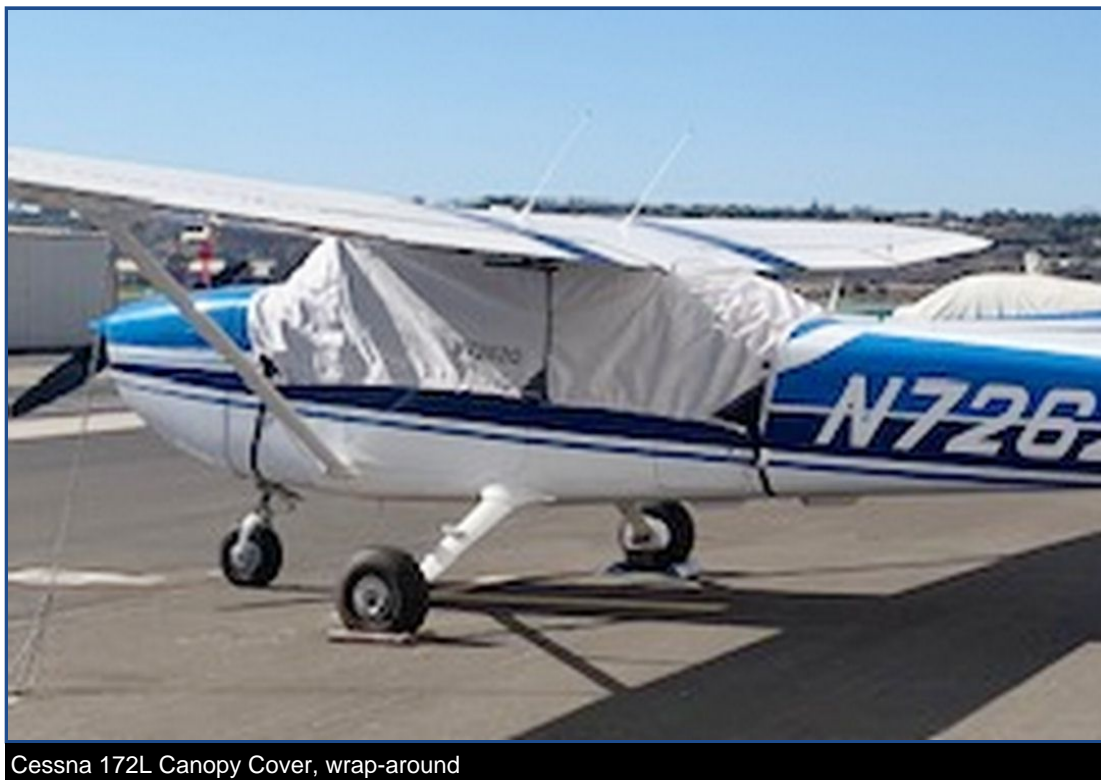
Cessna 172L Canopy Cover, wrap-around