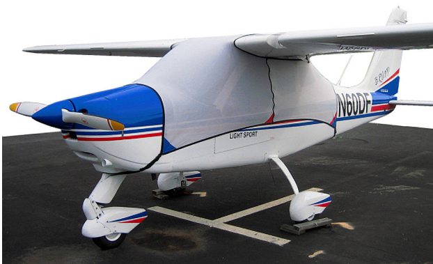
Tecnam Bravo Spandex FlyAway Travel Canopy Cover

Travel Covers are made with Silver Solution-Dyed Polyester fabric and only lined over the windshield to save weight. The material is lightweight and more compact for easy stowage in the aircraft. The polyester material is water resistant, but only intended for occasional use outside. We also have an ultra lightweight material available for fitted hangar dust covers. For daily outdoor use, the non-travel Sunbrella Cover is the best choice.