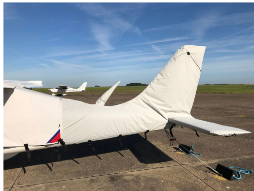
Tecnam P2008 Empennage Cover (Tailboom, Vertical & Horizontal Stabilizers), All Year Use