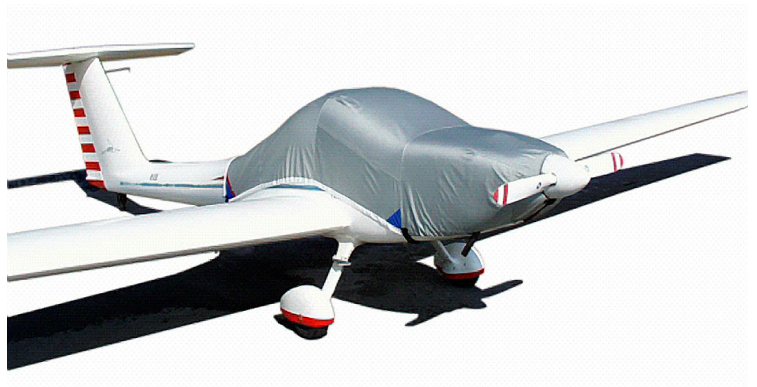
Grob 109 Canopy/Engine Cover