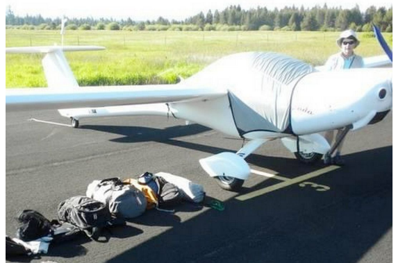
Distar Sundancer Travel Weight Canopy Cover