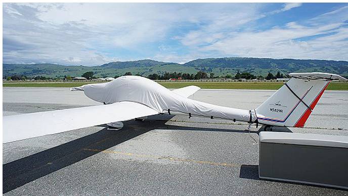
Grob 109 Canopy/Engine w/ extension to tail, Wing, Stabilizer & Prop/Spinner Covers

WINTER USE MATERIAL - Made with Solution-Dyed Polyester fabric, this option is intended for seasonal use to aid in deicing, rain mitigation, or for occasional travel. The material is lighter and more compact, but more susceptible to UV damage and may have a shorter useful life if used continuously outside than the all-year use material.