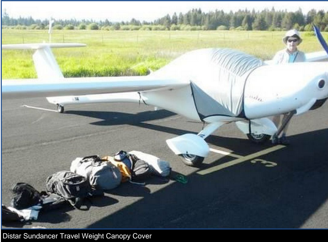
Distar Sundancer Travel Weight Canopy Cover