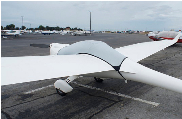
Lambda Canopy/Engine Cover and Wing Covers