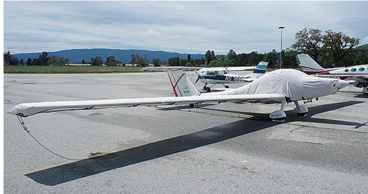
Grob 109 Canopy/Engine w/ extension to tail, Wing, Stabilizer &amp; Prop/Spinner Covers