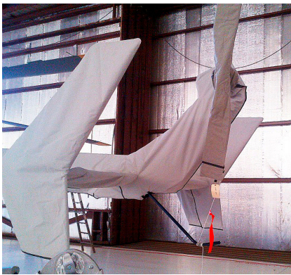
Tail Rotor Cover & Tailboom, Vertical Pylon & Stabilizers Cover