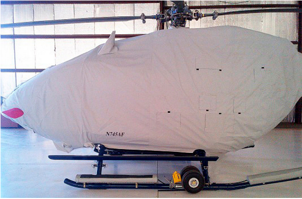
Eurocopter EC-145 Main Body Cover, also covers the bottom belly

Covers developed this material combination especially for aircraft protection. The outer material is medium weight and treated for water resistance, UV resistance and anti-static buildup. The inner lining is a very soft and smooth microfiber to prevent scratching. The material is very reflective, and tests show that the cabin interior temperature can be reduced to near-ambient temperature on the hottest of days. It is water, ice and snow repellent, yet breathable to allow moisture to escape from between the cover and the aircraft surface.