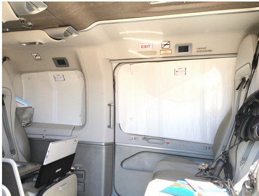
Eurocopter EC-145 Cabin Heatshields

Cockpit Heatshields are interior sunshades for the aircraft's cockpit. The product is a unique composite of closed-cell foam with a silver mylar finish. The semi-rigid design is stiff enough to stand inside the window framing. Darts and folds are incorporated into the material so that it conforms to the complex shape of the helicopter windows. The set folds up flat and is easily stored in the included storage sleeve. Some designs may require velcro and suction cups. A Heatshield is an excellent short-term remedy for cockpit overheating, but an external fabric cover is more effective for long-term protection.