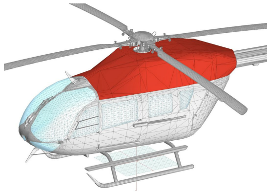
Intake/Exhaust Engine Area Cover, 3D Rendering

The Engine Inlet Plugs are custom fit for your Eurocopter UH-72 (EC-145) intakes, made with heavy-duty vinyl material, and stuffed with a single block of sculpted urethane foam. Each plug has a zipper that allows the foam to be removed and dried if necessary. Engine plugs have 'Remove Before Flight' streamers sewn onto the face of the plugs. Most plugs are imprinted with the aircraft registration number in black for an extra charge. Storage bag NOT included. Engine plugs may be inserted after flight when the engine is still warm. Engine Inlet Plugs are commonly referred to as Cowl Plugs, Intake Plugs, Cowl Blocks, Engine Blocks, and Engine Bungs.