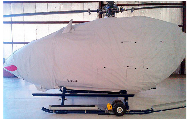
Eurocopter EC-145 Main Body Cover, also covers the bottom belly