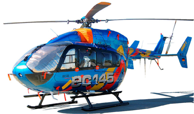
EC-145 Cabin Heatshield Set