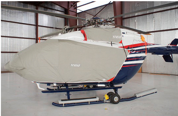
Upper Deck Plugs/Cover, extended to cover aft intake vents Bubble Cover w/ nose mounted radome, Upper Deck Plugs/Cover