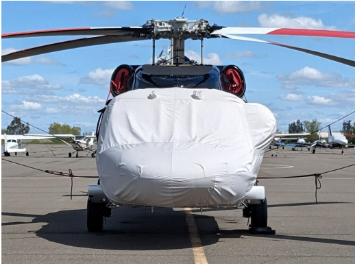
Sikorsky UH60 Windshield/Nose Cover

This cover type is made from Silver Acrylic Sunbrella canvas and is 100% lined with a soft and smooth microfiber. Bruce's Custom Covers developed this material combination especially for aircraft protection. The outer material is medium weight and treated for water resistance, UV resistance and anti-static buildup. The inner lining is a very soft and smooth microfiber to prevent scratching. The material is very reflective, and tests show that the cabin interior temperature can be reduced to near-ambient temperature on the hottest of days. It is water, ice and snow repellent, yet breathable to allow moisture to escape from between the cover and the aircraft surface.