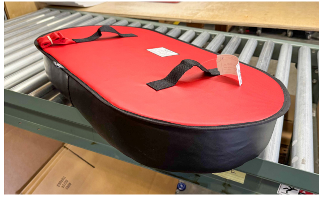
Sikorsky UH60 ENGINE EXHAUST PLUGS (HIRSS type), with safety lip