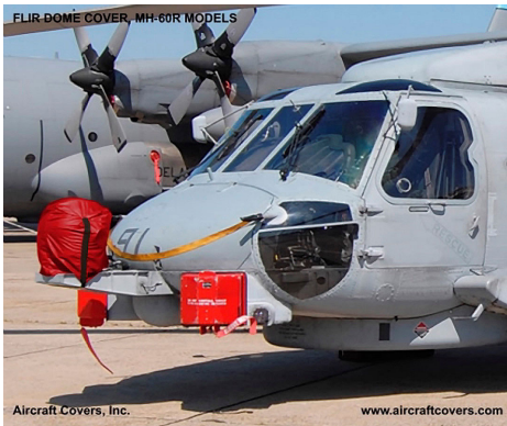
MH-60R FLIR DOME COVER (Navy)

ALL-YEAR USE MATERIAL - Made with Silver Acrylic Sunbrella canvas, the all-year use material is the best option for sun protection and cover longevity. This heavier more durable material is intended for all weather conditions, such as rain and snow or lots of sun.