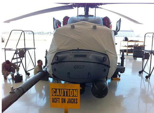
Windshield/Nose Cover for H60-G Model

This cover type is made from Silver Acrylic Sunbrella canvas and is 100% lined with a soft and smooth microfiber. Bruce's Custom Covers developed this material combination especially for aircraft protection. The outer material is medium weight and treated for water resistance, UV resistance and anti-static buildup. The inner lining is a very soft and smooth microfiber to prevent scratching. The material is very reflective, and tests show that the cabin interior temperature can be reduced to near-ambient temperature on the hottest of days. It is water, ice and snow repellent, yet breathable to allow moisture to escape from between the cover and the aircraft surface.