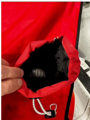
U.S. Coast Guard MH-60 Blade Covers

WINTER USE MATERIAL - Made with Solution-Dyed Polyester fabric, this option is intended for seasonal use to aid in deicing, rain mitigation, or for occasional travel. The material is lighter and more compact, but more susceptible to UV damage and may have a shorter useful life if used continuously outside than the all-year use material.