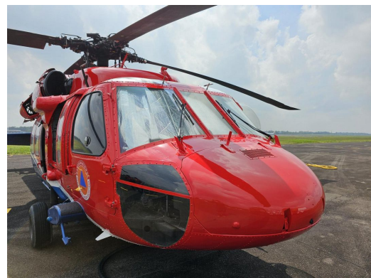
Sikorsky UH-60 Cockpit HeatShields