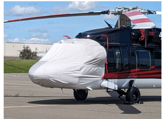
Sikorsky UH60 Windshield/Nose Cover