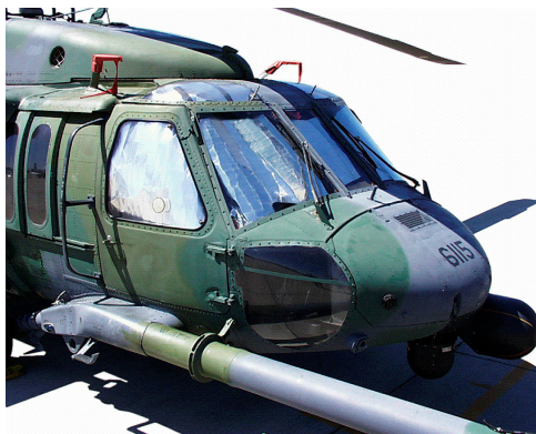
Cockpit HeatShields for UH60

Cockpit Heatshields are interior sunshades for the aircraft's cockpit. The product is a unique composite of closed-cell foam with a silver mylar finish. The semi-rigid design is stiff enough to stand inside the window framing. Darts and folds are incorporated into the material so that it conforms to the complex shape of the helicopter windows. The set folds up flat and is easily stored in the included storage sleeve. Some designs may require velcro and suction cups. A Heatshield is an excellent short-term remedy for cockpit overheating, but an external fabric cover is more effective for long-term protection.