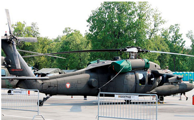
Engine Intake/Exhaust Covers Set

WINTER USE MATERIAL - Made with Solution-Dyed Polyester fabric, this option is intended for seasonal use to aid in deicing, rain mitigation, or for occasional travel. The material is lighter and more compact, but more susceptible to UV damage and may have a shorter useful life if used continuously outside than the all-year use material.