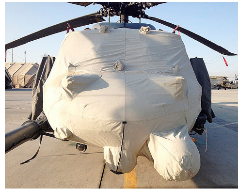
UH-60 Cockpit/Nose Cover