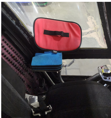
Boeing Vertol CH-47 Logger Window Plug