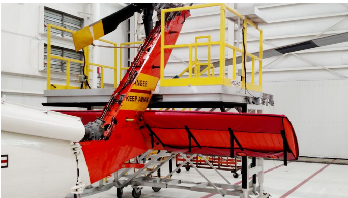
Sikorsky Blackhawk Horizontal Stabilizer Covers, Padded for maintenance protection