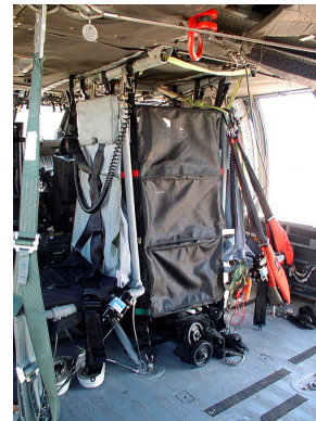
Suspended Storage Cage "Pizza Box"