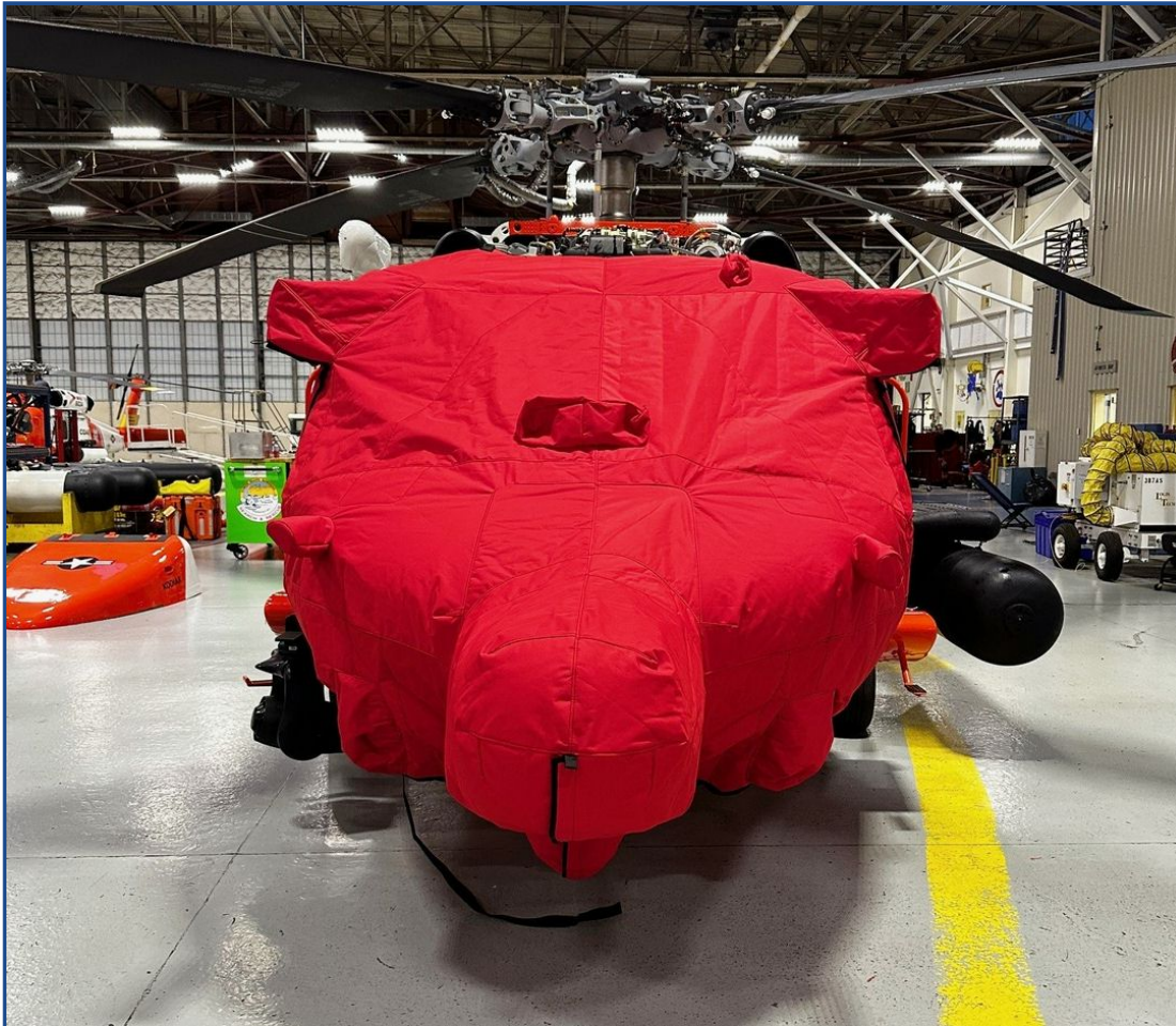
U.S. Coast Guard MH-60 Cockpit/Nose Cover