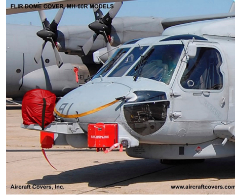
MH-60R FLIR DOME COVER (Navy)