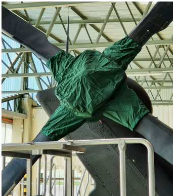
Sikorsky UH60 Tail Rotor Hub Cover

WINTER USE MATERIAL - Made with Solution-Dyed Polyester fabric, this option is intended for seasonal use to aid in deicing, rain mitigation, or for occasional travel. The material is lighter and more compact, but more susceptible to UV damage and may have a shorter useful life if used continuously outside than the all-year use material.