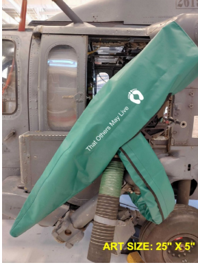
UH60 50 cal. Gun Cover