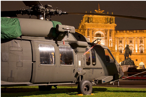
Engine Intake/Exhaust Covers Set, P/N UH60-104 or UH60-105