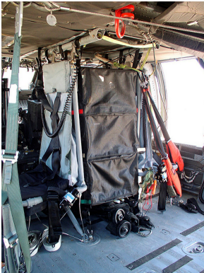
Suspended Storage Cage "Pizza Box"