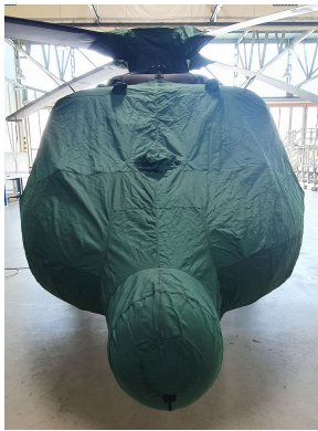
Sikorsky UH60 Cockpit/Nose Cover

This cover type is made from Silver Acrylic Sunbrella canvas and is 100% lined with a soft and smooth microfiber. Bruce's Custom Covers developed this material combination especially for aircraft protection. The outer material is medium weight and treated for water resistance, UV resistance and anti-static buildup. The inner lining is a very soft and smooth microfiber to prevent scratching. The material is very reflective, and tests show that the cabin interior temperature can be reduced to near-ambient temperature on the hottest of days. It is water, ice and snow repellent, yet breathable to allow moisture to escape from between the cover and the aircraft surface.