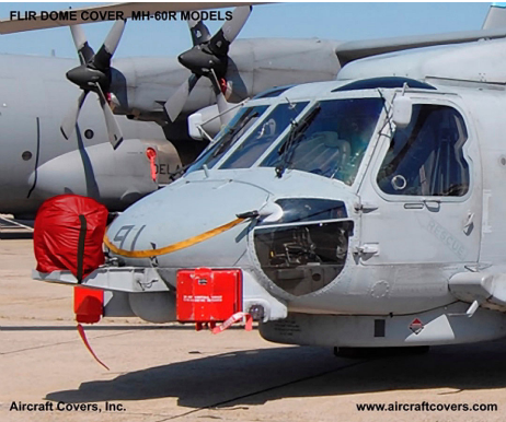
MH-60R FLIR DOME COVER (Navy)

ALL-YEAR USE MATERIAL - Made with Silver Acrylic Sunbrella canvas, the all-year use material is the best option for sun protection and cover longevity. This heavier more durable material is intended for all weather conditions, such as rain and snow or lots of sun.