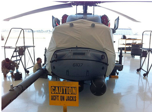
Windshield/Nose Cover for H60-G Model

This cover type is made from Silver Acrylic Sunbrella canvas and is 100% lined with a soft and smooth microfiber. Bruce's Custom Covers developed this material combination especially for aircraft protection. The outer material is medium weight and treated for water resistance, UV resistance and anti-static buildup. The inner lining is a very soft and smooth microfiber to prevent scratching. The material is very reflective, and tests show that the cabin interior temperature can be reduced to near-ambient temperature on the hottest of days. It is water, ice and snow repellent, yet breathable to allow moisture to escape from between the cover and the aircraft surface.