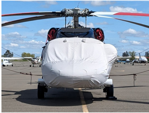
Sikorsky UH60 Windshield/Nose Cover

This cover type is made from Silver Acrylic Sunbrella canvas and is 100% lined with a soft and smooth microfiber. Bruce's Custom Covers developed this material combination especially for aircraft protection. The outer material is medium weight and treated for water resistance, UV resistance and anti-static buildup. The inner lining is a very soft and smooth microfiber to prevent scratching. The material is very reflective, and tests show that the cabin interior temperature can be reduced to near-ambient temperature on the hottest of days. It is water, ice and snow repellent, yet breathable to allow moisture to escape from between the cover and the aircraft surface.