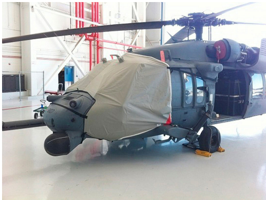
Windshield/Cockpit Chin Bubble Cover (Can be padded or unpadded)

This cover type is made from Silver Acrylic Sunbrella canvas and is 100% lined with a soft and smooth microfiber. Bruce's Custom Covers developed this material combination especially for aircraft protection. The outer material is medium weight and treated for water resistance, UV resistance and anti-static buildup. The inner lining is a very soft and smooth microfiber to prevent scratching. The material is very reflective, and tests show that the cabin interior temperature can be reduced to near-ambient temperature on the hottest of days. It is water, ice and snow repellent, yet breathable to allow moisture to escape from between the cover and the aircraft surface.