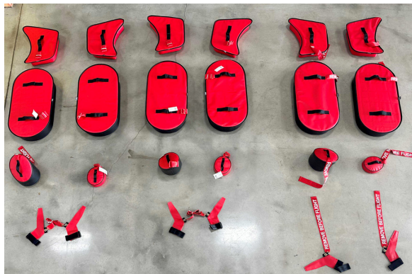
Sikorsky UH-60A Plug Set