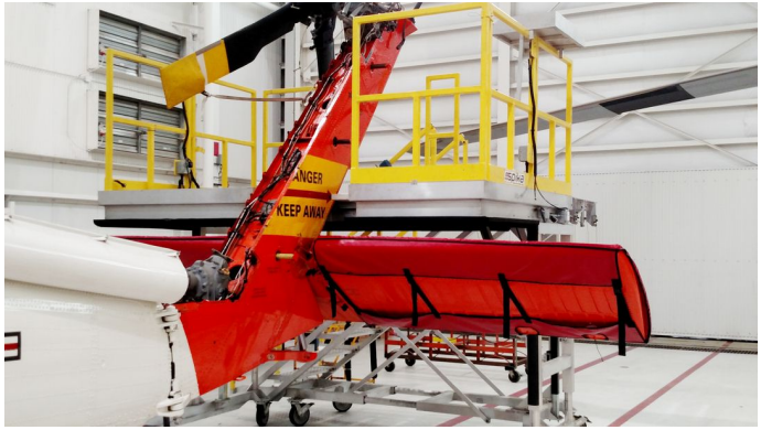
Sikorsky Blackhawk Horizontal Stabilizer Covers, Padded for maintenance protection