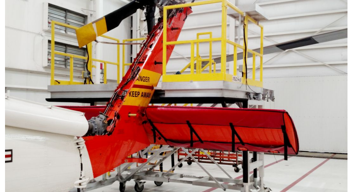
Sikorsky Blackhawk Horizontal Stabilizer Covers, Padded for maintenance protection