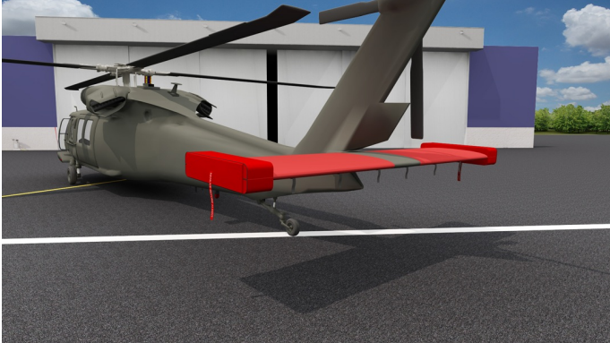
Padded Horizontal Stab Covers, Wingtip Pads (illustration)

Designed to prevent damage to the aircraft extremities in crowded hangars, these products are made of bright red Naugahyde and thickly padded with a sandwich of closed cell foam.