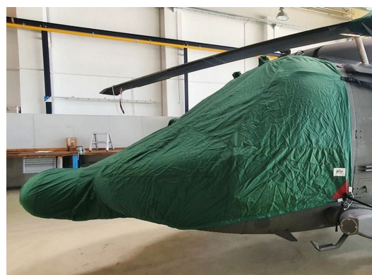
Sikorsky UH60 Cockpit/Nose Cover