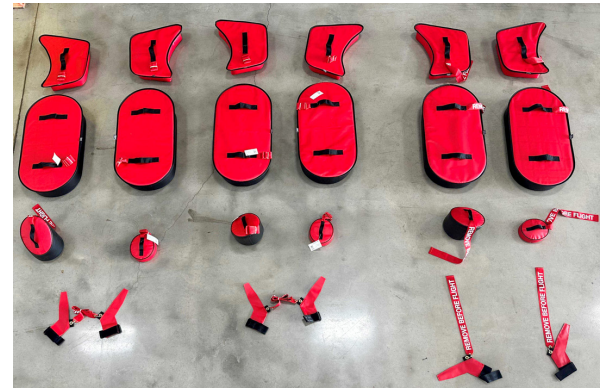
Sikorsky UH60 ENGINE EXHAUST PLUGS (HIRSS type), with safety lip