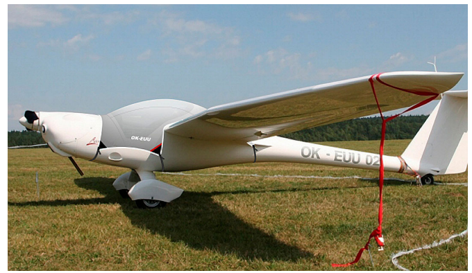
Lambda Canopy Cover (illustration)