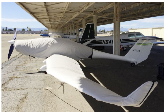
Phoenix Air U-15 Canopy/Engine, Wing & Horizontal Stabilizer Covers