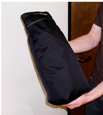
Light Weight Travel-Cover Mini-Storage Bag: 18" x 6" x 4"