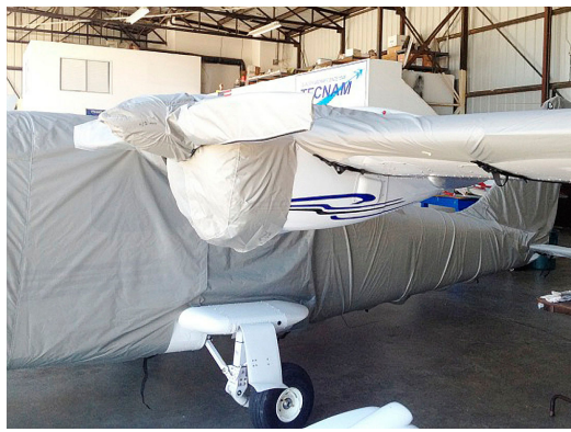
Tecnam Twin Canopy/Nose, Empennage, Wing/Engine, & Propellor/Spinner Covers