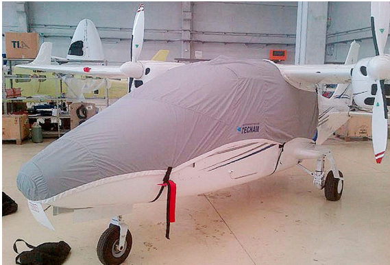
Tecnam P2006T Twin Lightweight Travel Canopy/Nose Cover

Travel Covers are made with Silver Solution-Dyed Polyester fabric and only lined over the windshield to save weight. The material is lightweight and more compact for easy stowage in the aircraft. The polyester material is water resistant, but only intended for occasional use outside. We also have an ultra lightweight material available for fitted hangar dust covers. For daily outdoor use, the non-travel Sunbrella Cover is the best choice.