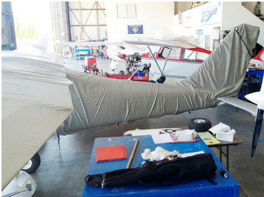
Tecnam Twin Canopy/Nose, Empennage, Wing/Engine, & Propellor/Spinner Covers Tecnam Twin Wing & Empennage Covers