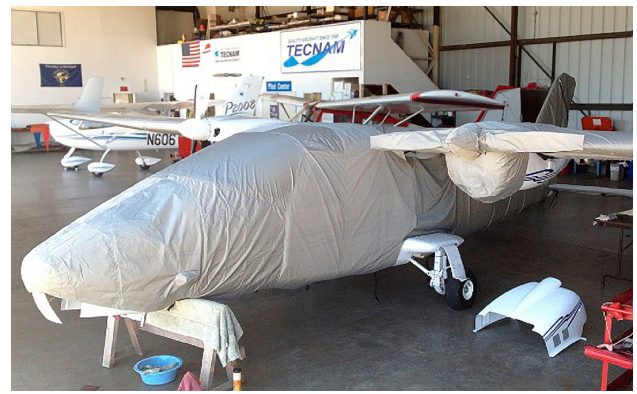
Tecnam Twin Canopy/Nose, Empennage, Wing/Engine, & Propellor/Spinner Covers