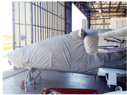
Tecnam Twin Canopy/Nose, Empennage, Wing/Engine, & Propellor/Spinner Covers