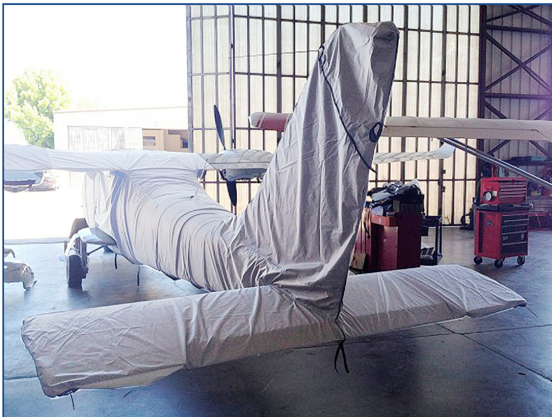
Tecnam Twin Canopy/Nose, Empennage, Wing/Engine, &amp; Propellor/Spinner Covers