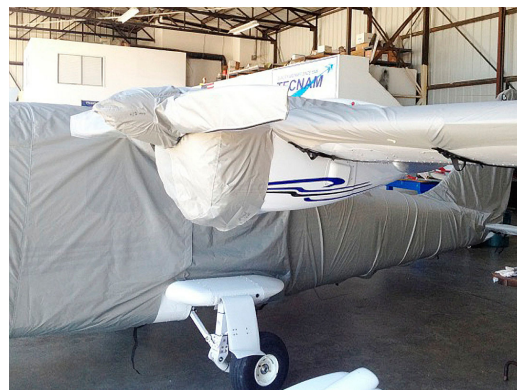
Tecnam Twin Canopy/Nose, Empennage, Wing/Engine, & Propellor/Spinner Covers