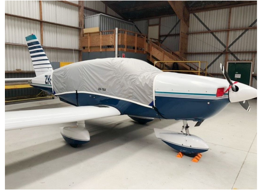
Socata TB-9 TRAVEL COVER, Light Weight Canopy Cover