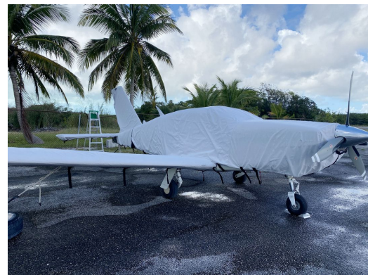
Socata Trinidad Full Cover Set