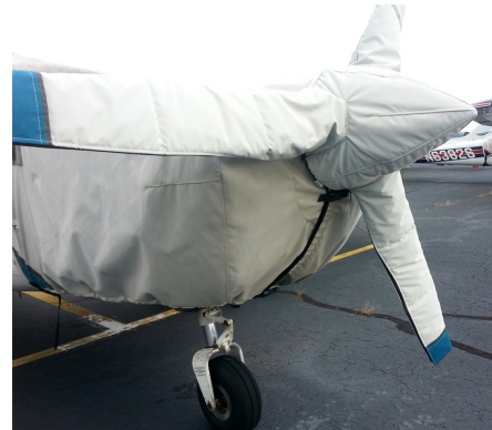
Socata Trinidad/Tobago Engine & Prop Covers