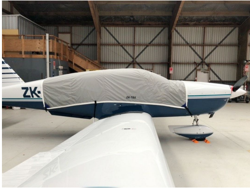
Socata TB-9 TRAVEL COVER, Light Weight Canopy Cover

Travel Covers are made with Silver Solution-Dyed Polyester fabric and only lined over the windshield to save weight. The material is lightweight and more compact for easy stowage in the aircraft. The polyester material is water resistant, but only intended for occasional use outside. We also have an ultra lightweight material available for fitted hangar dust covers. For daily outdoor use, the non-travel Sunbrella Cover is the best choice.