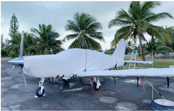
Socata Trinidad Full Cover Set

This cover type is made from Silver Acrylic Sunbrella canvas and is 100% lined with a soft and smooth microfiber. Bruce's Custom Covers developed this material combination especially for aircraft protection. The outer material is medium weight and treated for water resistance, UV resistance and anti-static buildup. The inner lining is a very soft and smooth microfiber to prevent scratching. The material is very reflective, and tests show that the cabin interior temperature can be reduced to near-ambient temperature on the hottest of days. It is water, ice and snow repellent, yet breathable to allow moisture to escape from between the cover and the aircraft surface.