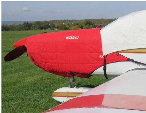
Socata TB-10 Insulated Engine Cover

This cover type is made from Silver Acrylic Sunbrella canvas and is 100% lined with a soft and smooth microfiber. Bruce's Custom Covers developed this material combination especially for aircraft protection. The outer material is medium weight and treated for water resistance, UV resistance and anti-static buildup. The inner lining is a very soft and smooth microfiber to prevent scratching. The material is very reflective, and tests show that the cabin interior temperature can be reduced to near-ambient temperature on the hottest of days. It is water, ice and snow repellent, yet breathable to allow moisture to escape from between the cover and the aircraft surface.