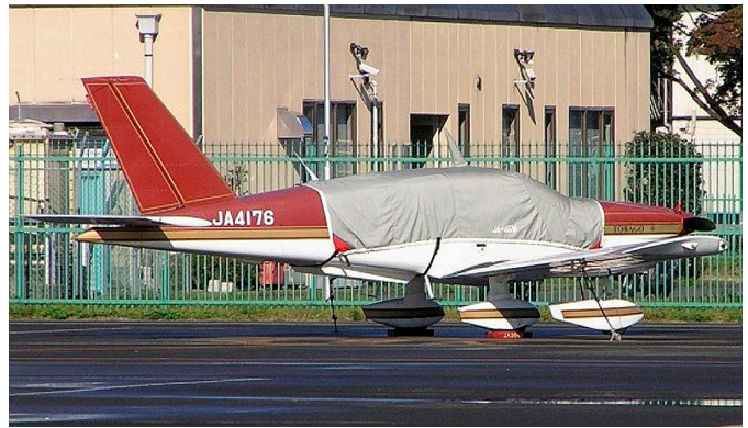
Socata TB-10 Tampico Canopy Cover