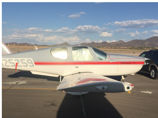
Socata TB-10 Cabin HeatShields

Windshield Heatshields are interior sunshades for an aircraft's front windshield. The product is a unique composite of closed-cell foam with a silver mylar finish. The semi-rigid design is stiff enough to stand along the inside of the windshield using sun visors or window framing. It folds up flat and easily stores in the included storage sleeve. Some designs may require velcro and suction cups or split right and left sides. A Heatshield is an excellent short-term remedy for cockpit overheating. An external fabric cover is far more effective and practical for long-term protection.