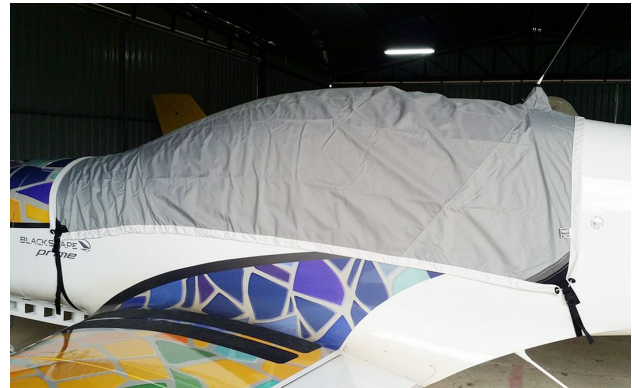
Blackshape Prime Travel Cover, Light Weight Travel Canopy Cover