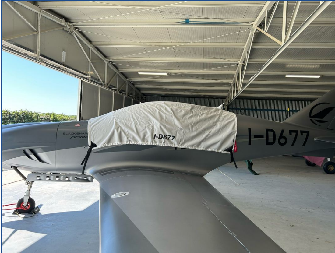
Blackshape Prime Canopy Cover