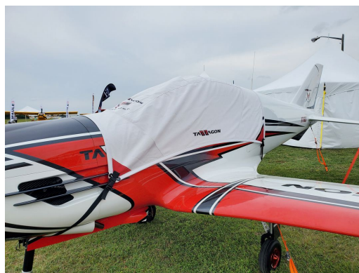
Pelegrin Tarragon Canopy Cover