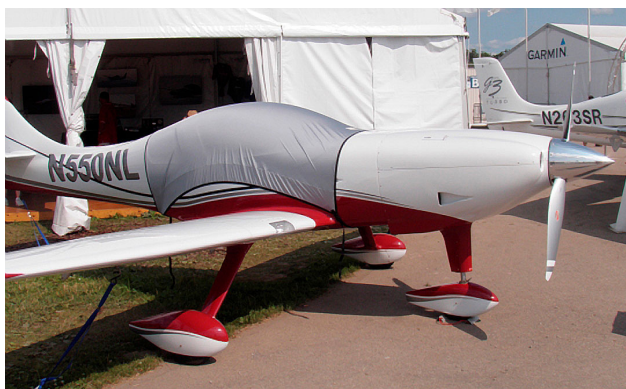
Light Weight Travel-Cover

This cover type is made from Silver Acrylic Sunbrella canvas and is 100% lined with a soft and smooth microfiber. Bruce's Custom Covers developed this material combination especially for aircraft protection. The outer material is medium weight and treated for water resistance, UV resistance and anti-static buildup. The inner lining is a very soft and smooth microfiber to prevent scratching. The material is very reflective, and tests show that the cabin interior temperature can be reduced to near-ambient temperature on the hottest of days. It is water, ice and snow repellent, yet breathable to allow moisture to escape from between the cover and the aircraft surface.