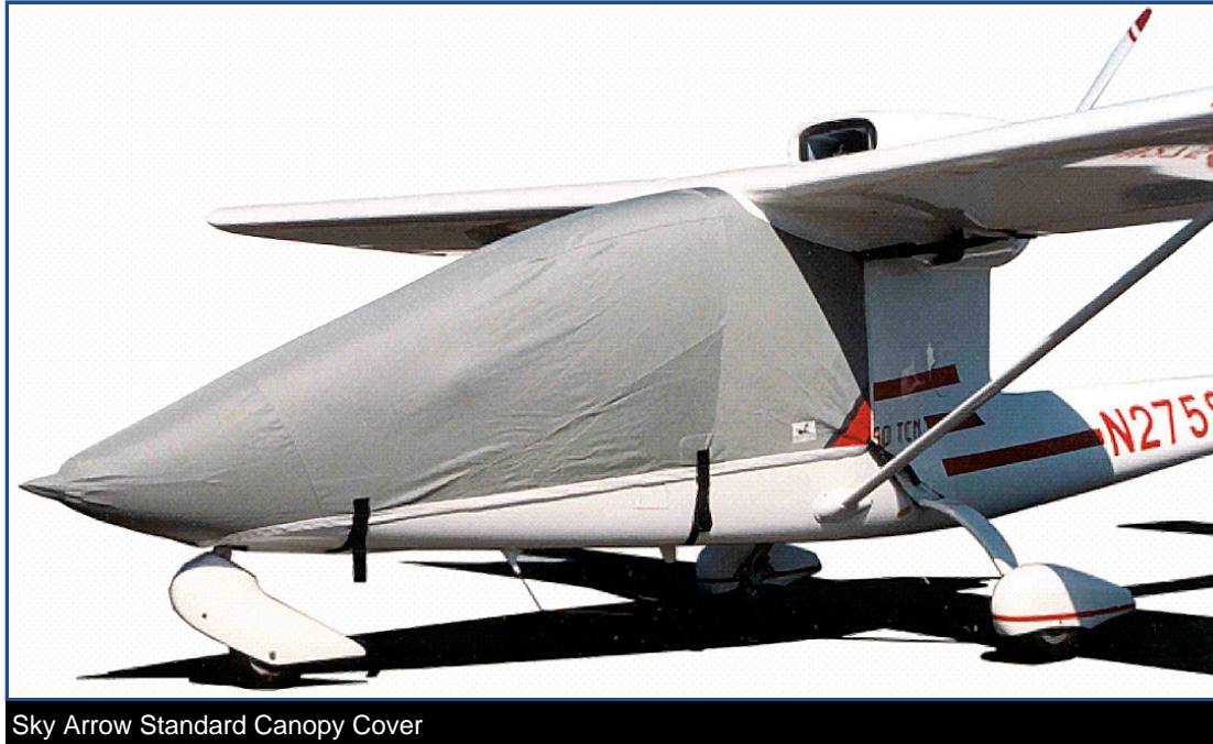
Sky Arrow Standard Canopy Cover