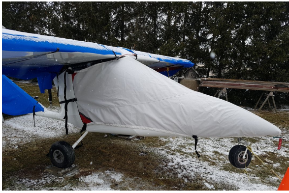
Titan Tornado Canopy/Nose Cover