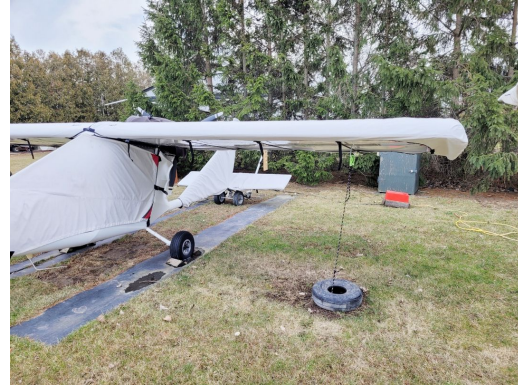
Titan Tornado Canopy/Nose, Wings & Empennage Cover