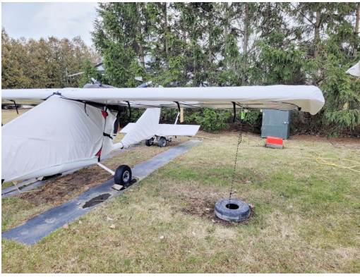
Titan Tornado Canopy/Nose, Wings & Empennage Cover