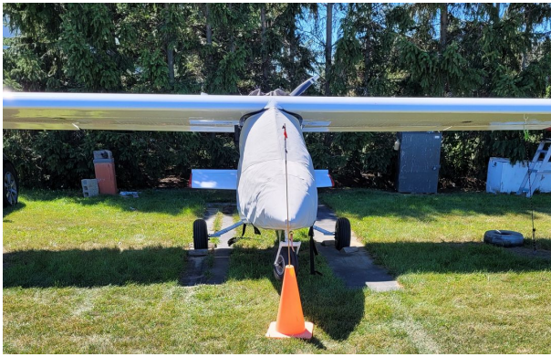
Titan Tornado Canopy/Nose Cover