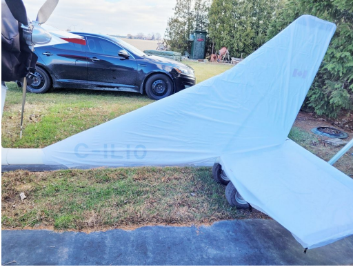
Titan Tornado Empennage Cover, test fit cover

WINTER USE MATERIAL - Made with Solution-Dyed Polyester fabric, this option is intended for seasonal use to aid in deicing, rain mitigation, or for occasional travel. The material is lighter and more compact, but more susceptible to UV damage and may have a shorter useful life if used continuously outside than the all-year use material.