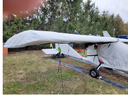
Titan Tornado Canopy/Nose, Wings & Empennage Cover