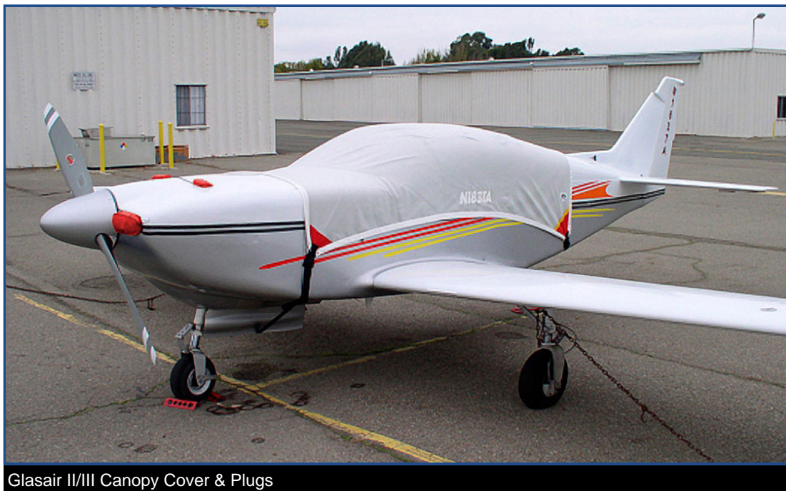
Glasair II/III Canopy Cover &amp; Plugs