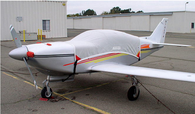
Glasair II/III Canopy Cover & Plugs

This cover type is made from Silver Acrylic Sunbrella canvas and is 100% lined with a soft and smooth microfiber. Bruce's Custom Covers developed this material combination especially for aircraft protection. The outer material is medium weight and treated for water resistance, UV resistance and anti-static buildup. The inner lining is a very soft and smooth microfiber to prevent scratching. The material is very reflective, and tests show that the cabin interior temperature can be reduced to near-ambient temperature on the hottest of days. It is water, ice and snow repellent, yet breathable to allow moisture to escape from between the cover and the aircraft surface.