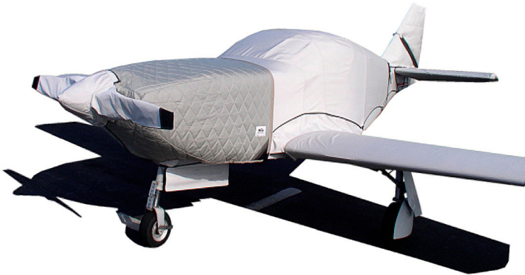
Glasair I Insulated Engine Cover, Prop Cover, Etc.

This cover type is made from Silver Acrylic Sunbrella canvas and is 100% lined with a soft and smooth microfiber. Bruce's Custom Covers developed this material combination especially for aircraft protection. The outer material is medium weight and treated for water resistance, UV resistance and anti-static buildup. The inner lining is a very soft and smooth microfiber to prevent scratching. The material is very reflective, and tests show that the cabin interior temperature can be reduced to near-ambient temperature on the hottest of days. It is water, ice and snow repellent, yet breathable to allow moisture to escape from between the cover and the aircraft surface.