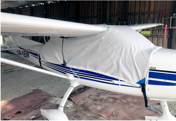
TL Ultralight Sirius TL-3000 Canopy Cover (Over-The-Top Style)

This cover type is made from Silver Acrylic Sunbrella canvas and is 100% lined with a soft and smooth microfiber. Bruce's Custom Covers developed this material combination especially for aircraft protection. The outer material is medium weight and treated for water resistance, UV resistance and anti-static buildup. The inner lining is a very soft and smooth microfiber to prevent scratching. The material is very reflective, and tests show that the cabin interior temperature can be reduced to near-ambient temperature on the hottest of days. It is water, ice and snow repellent, yet breathable to allow moisture to escape from between the cover and the aircraft surface.