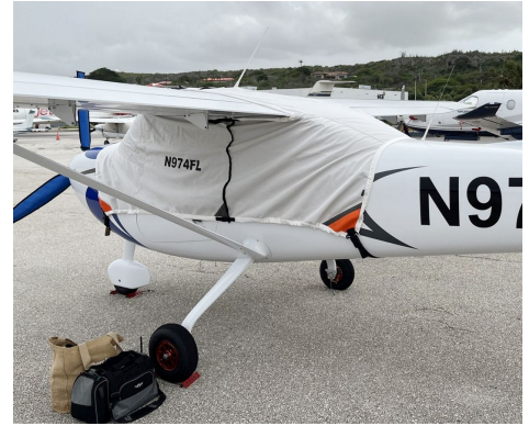
Orlican Eagle M-8 Canopy Cover