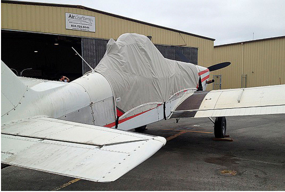
Piper Brave PA-36 Canopy/Hopper Cover

This cover type is made from Silver Acrylic Sunbrella canvas and is 100% lined with a soft and smooth microfiber. Bruce's Custom Covers developed this material combination especially for aircraft protection. The outer material is medium weight and treated for water resistance, UV resistance and anti-static buildup. The inner lining is a very soft and smooth microfiber to prevent scratching. The material is very reflective, and tests show that the cabin interior temperature can be reduced to near-ambient temperature on the hottest of days. It is water, ice and snow repellent, yet breathable to allow moisture to escape from between the cover and the aircraft surface.