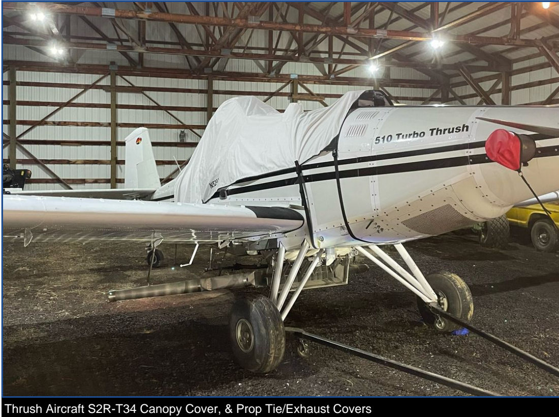
Thrush Aircraft S2R-T34 Canopy Cover, &amp; Prop Tie/Exhaust Covers