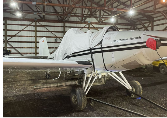
Thrush Aircraft S2R-T34 Canopy Cover, & Prop Tie/Exhaust Covers