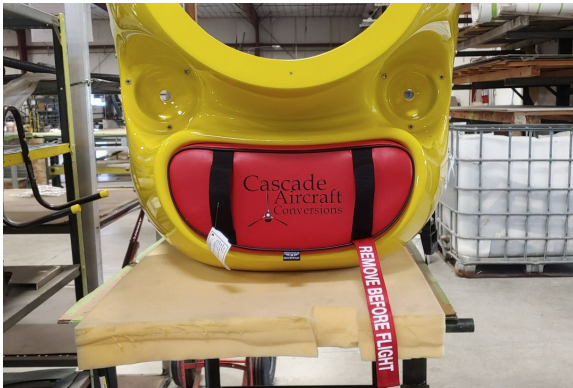
Thrush Intake Plug (Cascade Conversion)

Engine Inlet Plugs are custom fit for your Ayres Thrush intakes, made with heavy-duty vinyl material, and stuffed with a single block of sculpted urethane foam. Each plug has a zipper that allows the foam to be removed and dried if necessary. Engine plugs have warning flags that are visible from the cockpit or 'remove before flight' streamers sewn onto the face of the plugs. Most plugs are imprinted with the aircraft registration number in black for an extra charge. Storage bag NOT included. Engine plugs may be inserted after flight when the engine is still warm. Engine Inlet Plugs are commonly referred to as Cowl Plugs, Intake Plugs, Cowl Blocks, Engine Blocks, and Engine Bungs.