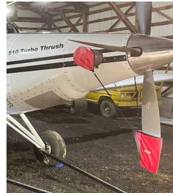
Ayres Thrush Prop Tie/Exhaust Covers