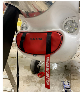
Ayres Thrush Intake Plug (Cascade Conversion)