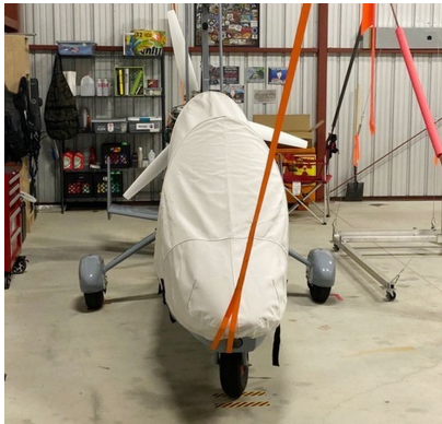
Magni Auto Gyro M16 Cockpit/Nose Cover

Travel Covers are made with Silver Solution-Dyed Polyester fabric and fully lined over the entire cover. The material is lightweight and more compact for easy stowage in the aircraft. The polyester material is water resistant, but only intended for occasional use outside. We also have an ultra lightweight material available for fitted hangar dust covers. For daily outdoor use, the non-travel Sunbrella Cover is the best choice.