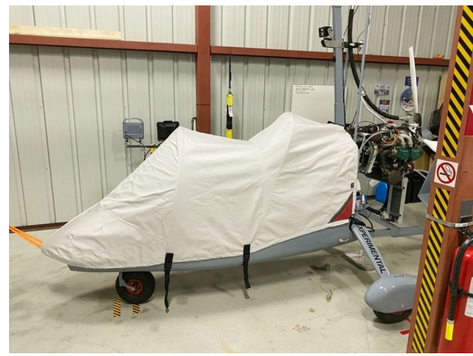
Magni Auto Gyro M16 Cockpit/Nose Cover