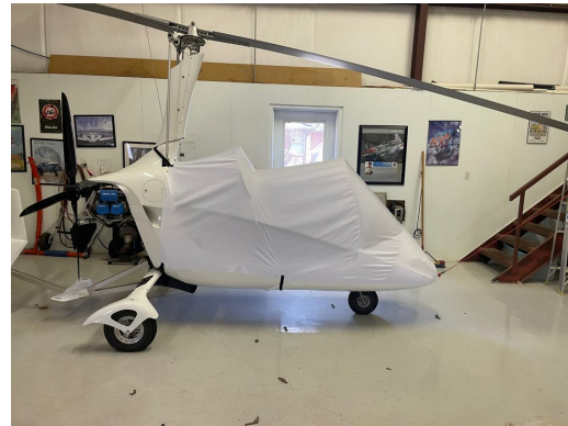
MTO Sport Gyrocopter Canopy/Nose Cover, test fit cover