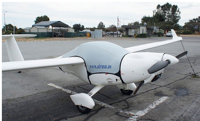
Lambada Travel Canopy Cover