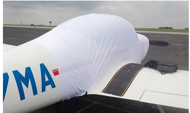
Taifun 17E Canopy/Engine Cover, test fit cover