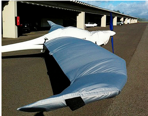
Lambda Canopy/Engine Cover and Wing Covers