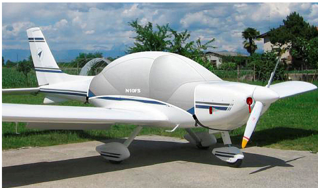
Texan Canopy Cover & Engine Plugs (Illustration)

This cover type is made from Silver Acrylic Sunbrella canvas and is 100% lined with a soft and smooth microfiber. Bruce's Custom Covers developed this material combination especially for aircraft protection. The outer material is medium weight and treated for water resistance, UV resistance and anti-static buildup. The inner lining is a very soft and smooth microfiber to prevent scratching. The material is very reflective, and tests show that the cabin interior temperature can be reduced to near-ambient temperature on the hottest of days. It is water, ice and snow repellent, yet breathable to allow moisture to escape from between the cover and the aircraft surface.