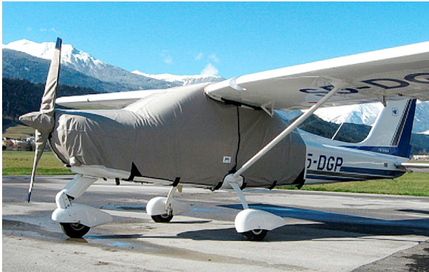
Tecnam Echo Extended Canopy, Engine, Prop Covers

This cover type is made from Silver Acrylic Sunbrella canvas and is 100% lined with a soft and smooth microfiber. Bruce's Custom Covers developed this material combination especially for aircraft protection. The outer material is medium weight and treated for water resistance, UV resistance and anti-static buildup. The inner lining is a very soft and smooth microfiber to prevent scratching. The material is very reflective, and tests show that the cabin interior temperature can be reduced to near-ambient temperature on the hottest of days. It is water, ice and snow repellent, yet breathable to allow moisture to escape from between the cover and the aircraft surface.