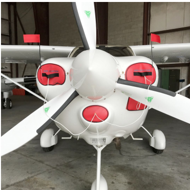
Tecnam P2010 Engine Plugs

Engine Inlet Plugs are custom fit for your Tecnam P92 Eaglet intakes, made with heavy-duty vinyl material, and stuffed with a single block of sculpted urethane foam. Each plug has a zipper that allows the foam to be removed and dried if necessary. Engine plugs have warning flags that are visible from the cockpit or 'remove before flight' streamers sewn onto the face of the plugs. Most plugs are imprinted with the aircraft registration number in black for an extra charge. Storage bag NOT included. Engine plugs may be inserted after flight when the engine is still warm. Engine Inlet Plugs are commonly referred to as Cowl Plugs, Intake Plugs, Cowl Blocks, Engine Blocks, and Engine Bungs.